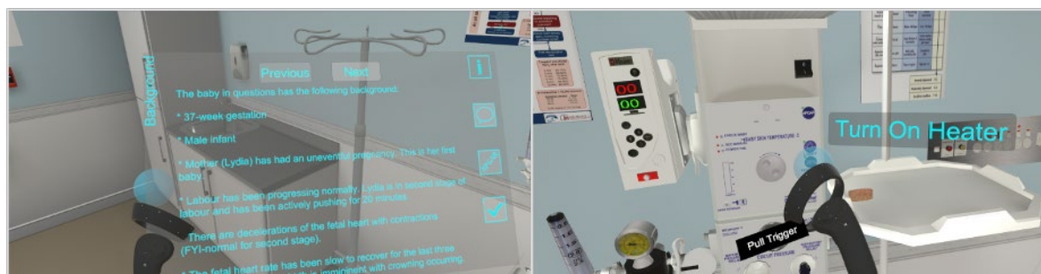
Figure 2: Users are guided by a series of technical information and instructions

Demonstrated in Figure 2 , users are guided through the scenario with a series of events that provide relevant clinical information and technical instructions to facilitate use. In the example shown in Figure 3 , a Windows Mixed Reality headset™ is being used with hand controllers to manipulate equipment in the virtual environment.