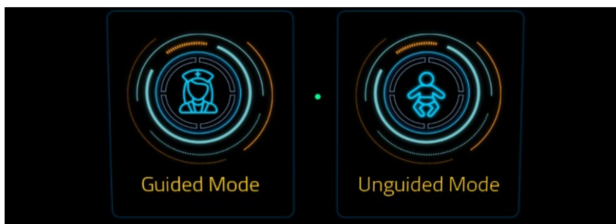
Figure 1: Guided and unguided mode of Compromised Neonate Care Simulation

content, Ivona™ for voice synthesis, Bitbucket® as the code repository and Jira® for program control management. The digital content was made available in both non-immersive and immersive VR software platforms. This was to allow for the program to be deployed and used on a personal computer (Microsoft Windows© based) and/or for use by commercially available HMDs such as HTC VIVE™ and Samsung Oculus™ (rift/ gear) VR hardware. An important design aspect was to afford users accessibility to the program in various settings such as classrooms, skills laboratories and at home.