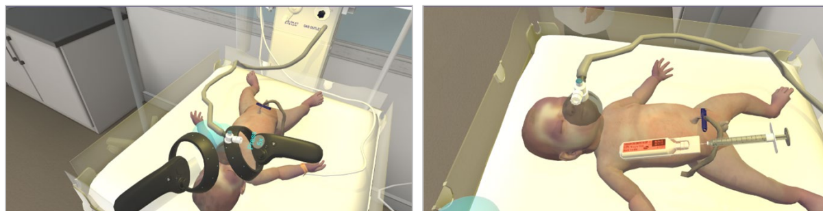
Figure 4: Users assist the neonate to breath using Continuous Positive Airway Pressure (CPAP) with the aid of an oropharyngeal airway mask and Neopuff™

instruments within the VR simulation affords an enhanced experiential learning opportunity to students; a process of learning through (virtual) hands-on experience (Fealy et al., 2019; Pottle, 2019).