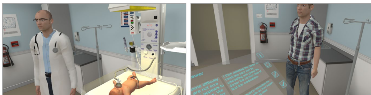
Figure 5: Users are able to interact with medical specialist and parent avatars

Figure 4 demonstrates the use of a Neopuff™ for airway and breathing controls and providing the required first-line medications, adrenaline and normal saline in a simulated neonatal resuscitation simulation. As can be seen, users are required to work with this equipment to simulate and replicate real-life neonatal resuscitation procedures. For instance, a user within the scenario required to draw up the medications will hold the medicine using the left controller, and with the right controller operating the syringe, will fill the syringe with medicine (pulling back the plunger to the line on the syringe for the required dosage).