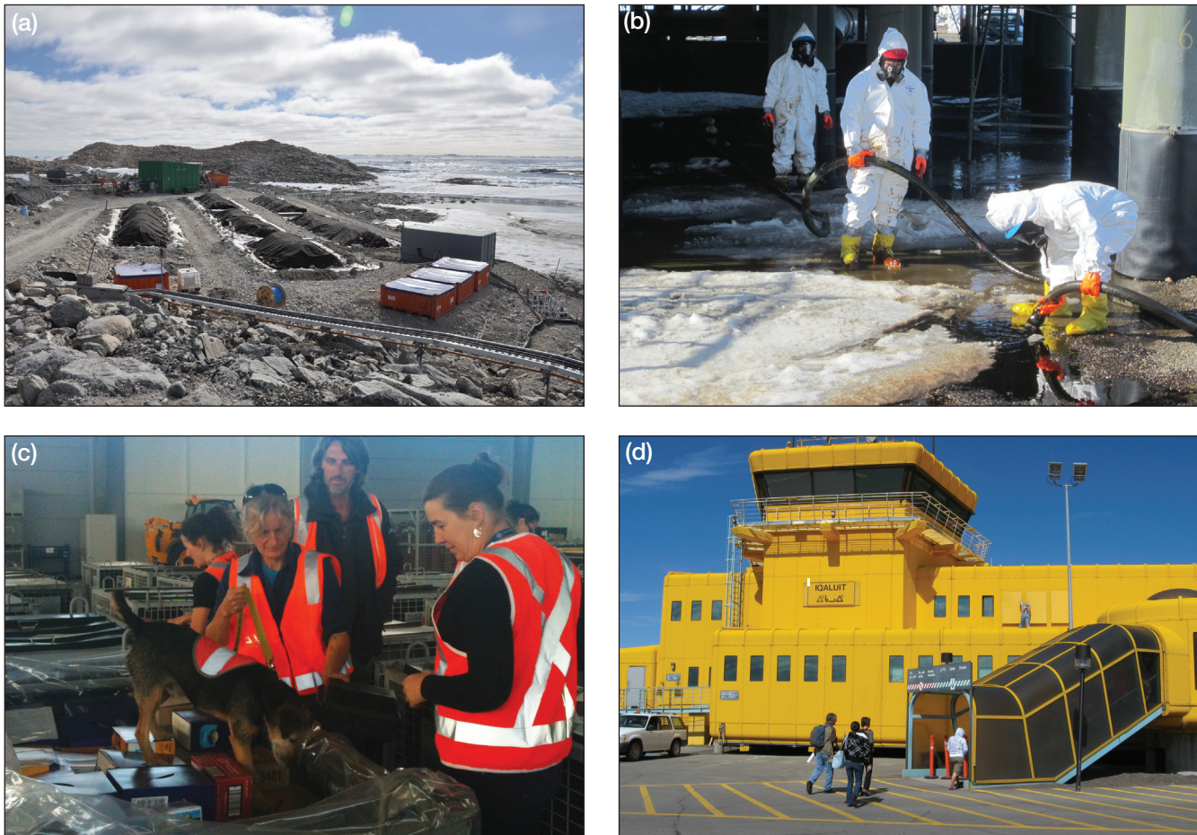
Figure 3. Examples of lessons learned that can be exchanged between the poles to improve environmental protection. (a) Collaboration between Canadian and Australian scientists has led to the deployment of geosynthetic liners and biopiles to remediate contamination at Casey Station, Antarctica. (b) Spill prevention and response protocols in Alaska are stringent and include an integrated network of spill-response units designed to react quickly to spills, such as this oil tank overflow. The adoption of a similar integrated strategy among Antarctic research stations would reduce the risk of environmental contamination. (c) Biosecurity protocols in the Antarctic are strict and continually improving. (d) Analogous techniques could be adopted in Arctic points of entry, such as Iqaluit, Canada, to reduce the considerable risk of species invasions due to propagule introduction and climate change.

prevention and response standards from Arctic nations could be incorporated into protocols for Antarctic stations. For example, Alaska has strong regulations for preventing oil spills and an integrated network of units designed to respond to a large spill, including a joint spill response and training program with Canada (Grabowski et al. 2014). At present, there is no hydrocarbon extraction in the Antarctic, and the volumes of oil being shipped on any single vessel are small relative to those transported by bulk carriers in the Arctic. Nonetheless, with the small resident population and scattered stations belonging to various nations, mounting an effective response to a major marine oil spill would be extremely difficult. This emphasizes the critical importance of developing an integrated prevention, response, and mitigation plan among Antarctic Treaty Parties, similar to that used by Alaska and Canada.