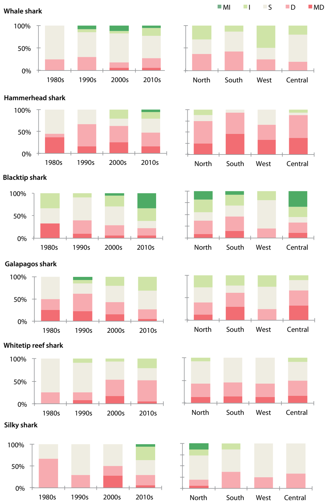
Figure 1. Summary of changes in shark populations by decade (left column) and bioregion (right column) for each species as perceived by dive guides. Scales of change: MI = major increase; I = increase; S = stable; D = decline; MD = major decline.