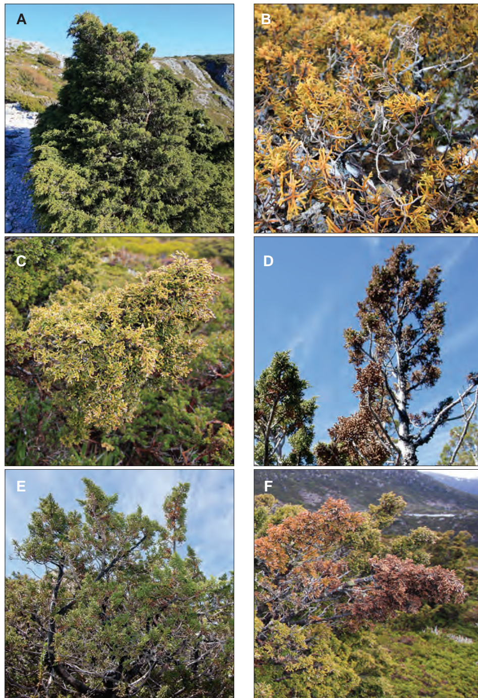
PLATE 3 Examples of Dwarf Pine, Diselma archeri, condition classes: (A), (C) = 4; (E), (B) = 3; (D), (F) = 2.