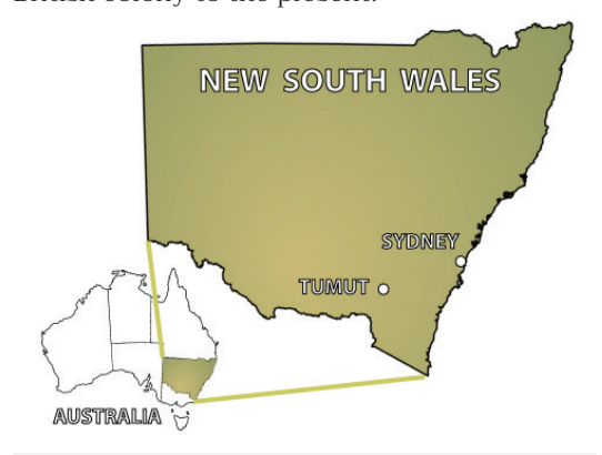
Fig. 1. Map of Australia showing the state of New South Wales (B.Wood).

Australia is comprised of six states and two territories (Figure 1), and although a new national curriculum has now been implemented for all Australian children aged 5 to 16 (ACARA 2016a), at the time of writing this article, each state is still responsible for developing its own senior secondary curriculum for students aged 16 to 18 years in the final two years of schooling. Since 2000 New South Wales has offered three senior history subjects: Ancient History, Modern History and History Extension. These courses are developed by the New South Wales Board of Studies, Training and Education Standards (BOSTES). The Cities of Vesuvius: Pompeii and Herculaneum is the core study within the subject of Ancient History and all students must answer compulsory questions on it in their final examination. In order to understand the 'Pompeii-mania' phenomenon that has emerged over the last ten years, it is necessary to briefly examine how the subject of Ancient History has developed in New South Wales since the early years of this former British colony to the present.