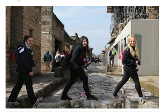
Fig. 3. Three students from Tumut High School during their tour of Pompeii.

small country town have visited Italy since the school trips started in 2003, and the cultural tours have had a big impact on the school and local community. For many Tumut High School students, who have never even visited the cities of Sydney or Canberra, the trip to Italy is a big event in their lives because it is their first time away from home and outside Australia.