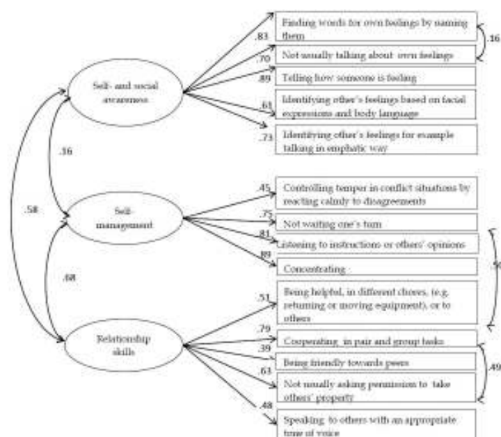
Figure 2 Measurement model of the hypothesized three-factor structure of the socioemotional skills observation scale

Paired samples t-tests revealed no differences in teacher-rated socioemotional skills between general kindergarten settings and the PE session. Independent samples t-test