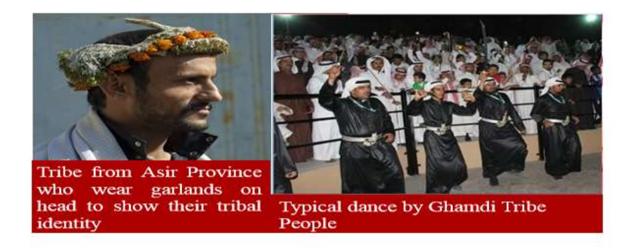
Figure 2 Photos of people representing different tribes

Akers' (2001) view that 'Qaba'il' concept is Saudi Arabia is 'exhibited through tribal markers' (P: 168) seem quite right here when applied to these findings. The youths in Saudi Arabia are quite conscious of their tribal belonging. In this case, Maisel's (2015) claims, that tribal association is resurgent among Saudis, are reflected in these findings.