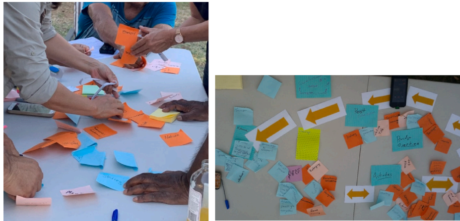
Fig. 1. During the storytelling sessions, important aspects and flows were also recorded on sticky notes by board members.

Hindle, 2007), board members spent much time discussing the importance of repairing/healing that damage ( 'Bridge over troubled waters' ) to build a better 'Future' . Notably, the ES and other keywords/activities embedded within the first three themes were seen as important contributors to that healing process.