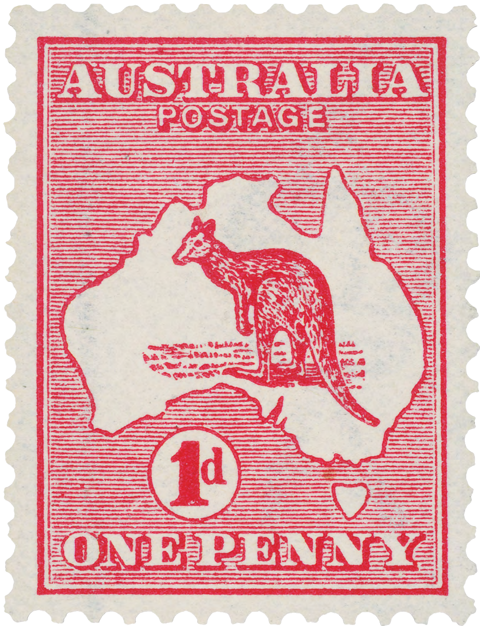
Figure 2: The 1913 kangaroo and map 1d postage stamp. Designer unknown; engraver: Samuel Reading.