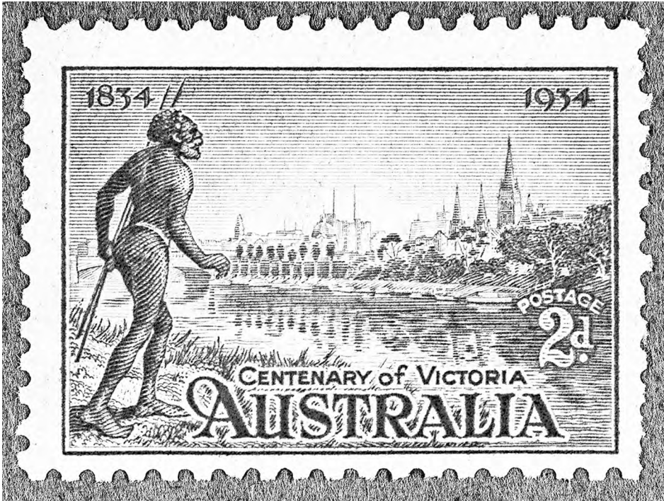
Figure 3: The 1934 'Centenary of Victoria' 2d postage stamp, 2 June 1934. The original work is held in the National Philatelic Collection.