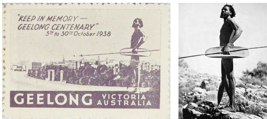
Figure 4: (left) The 1938 Centenary of Geelong collectable poster stamp of no postal validity produced by the City of Geelong. Designer unknown. The stamp features a print clearly based on the Walkabout photograph of Tjungurrayi; (right) The photograph of Tjungurrayi taken by Roy Dunstan that featured in Walkabout 2, no. 3 (1 January 1936): 14.