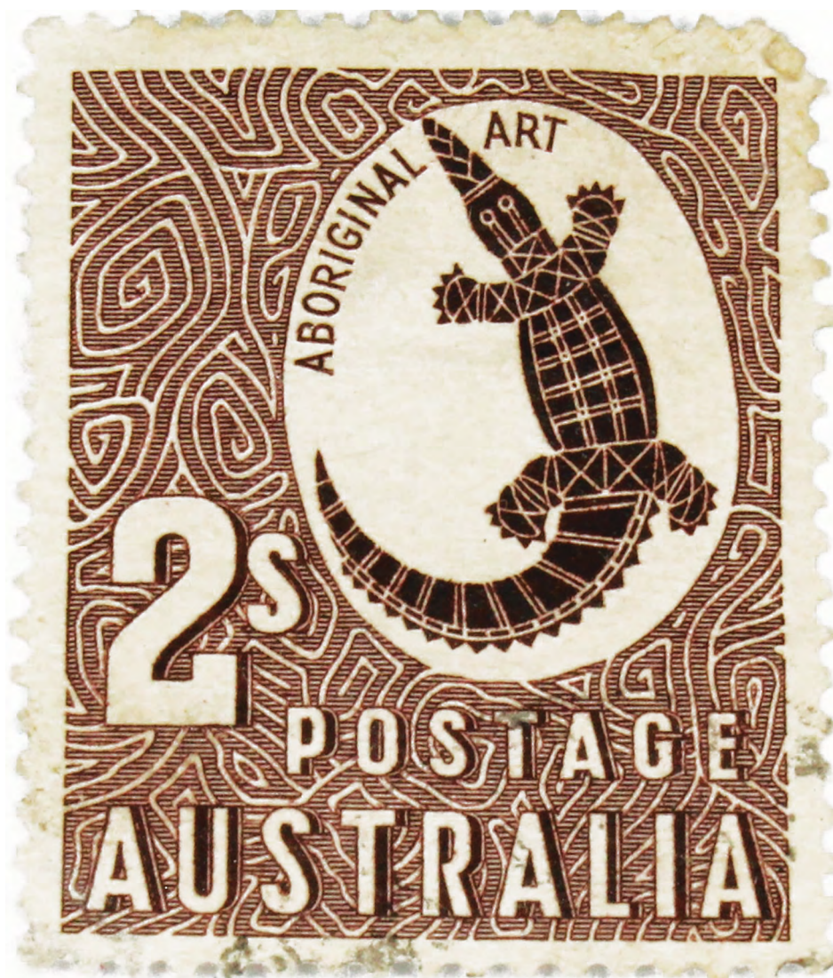
Figure 6: The 1948 'Aboriginal Art' 2s postage stamp. Designer: Gert Sellheim; Engraver: George Lissende.