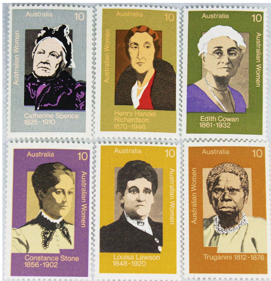
Figure 7: Six 1975 'Australian Women' 10c postage stamps from the 'Famous Women' series, the seventh issue in a series honouring famous Australians, released in 1975. The women pictured are Edith Cowan, Louisa Lawson, Ethel Richardson, Catherine Spence, Constance Stone and Truganini. Designers: Des and Jackie O'Brien.