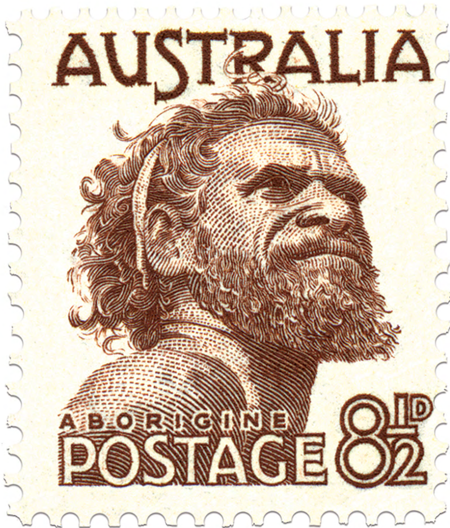
Figure 1: The 1950 'Aborigine' 8½d postage stamp featuring Gwoja Tjungurrayi. Designer and engraver: Frank Manley.