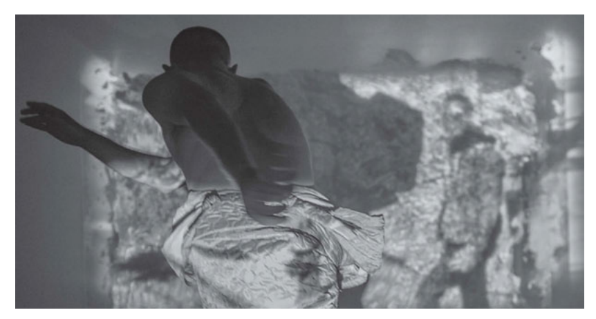
Figure 48: Ketl 2015, Hornblow and Sans, 2015. Image: Kinga Michalska

as deadlines loom large they also allow new forms of life to appear. To say "at the time of writing" may then become a matter of foregrounding the time of writing itself. Where immediacies shift across multiple durations and scales of action, we may feel many speeds and durations in which things already describe themselves somehow, and where media come to enact processes of thinking and making in the backand-forth of our own descriptions. If writing may describe a work, it is through singular, untimely and distributed processes of immediation where multiple media shift in tonality, opening and withdrawing, with and from one another.