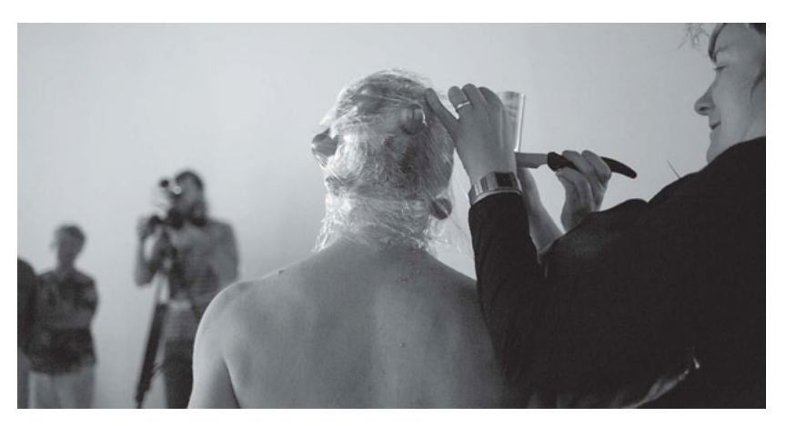
Figure 50. Ketl, Hornblow and Sans, 2015.