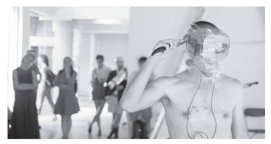
Figure 51. Ketl, Hornblow and Sans, 2015.

participation.<sup>14</sup> When virtuosic techniques seem to collapse, diverge or delay their effects, the affective gaps that issue from this may become more apparent between performer, audience, and the middlings of their media.