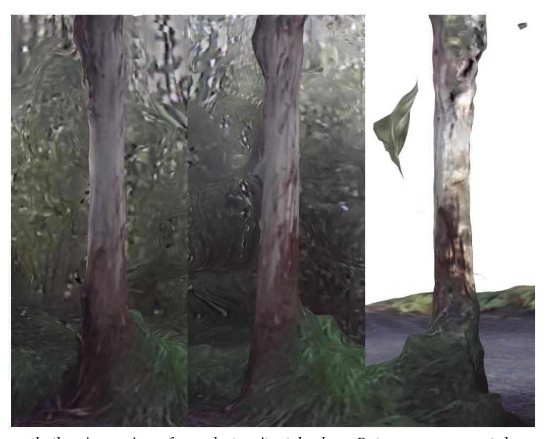
Figure 2 the three image views of a eucalyptus niten taken by a 3D stereo camera mounted on a drone

More broadly, the research program of this theme will continue to innovative and anticipates delivering even more tangible value to industry partners over the next 12-24 months.