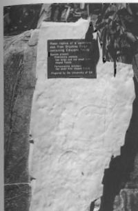
Artificial cast of fossil at Ediacara, South Australia

Significant geological sites may include outcrops of particular rock types, sites where fossils occur, exposures that reveal the nature of subsurface structures and a variety of other phenomena. 'Type sites' that provide the earliest or best example of particular phenomena provide important reference sites against which evidence found elsewhere can be compared in order to advance geological knowledge of broader regions. Such sites can be lost during some construction activities, such as building embankments to establish