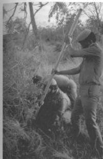
Removing weeds. Sri National Park, India.

Within any particular protected area, quarantine can be effective for many weed species. The dissemination of a large proportion of weed species