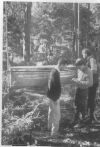
Monitoring bats using a trap net, Central-South Raintree Reserve, Australia