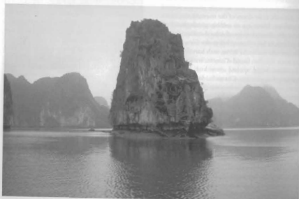
Ha Long Bay, Viet Nam