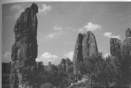
Lurnat stone forest, China

Some managers consider scientific research in their areas to be detached from practical management issues. However, a cooperative scientist can provide invaluable insights into how ecosystems work and can be encouraged to collect data that you want for management purposes. Natural scientists tend to return regularly to their research sites, making them valuable repositories of all sorts of resources apart from the data they collect for their projects. Older people whose families have had a long history of exploiting, living in or recolonizing in your protected area can be invaluable