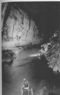
Source: Gunung Mulu, Malaysia

The one exception to this long-term perspective on putative disasters arises when park managers are charged with protecting a critical natural heritage asset in a spatially constrained area that represents the last scraps of a former habitat