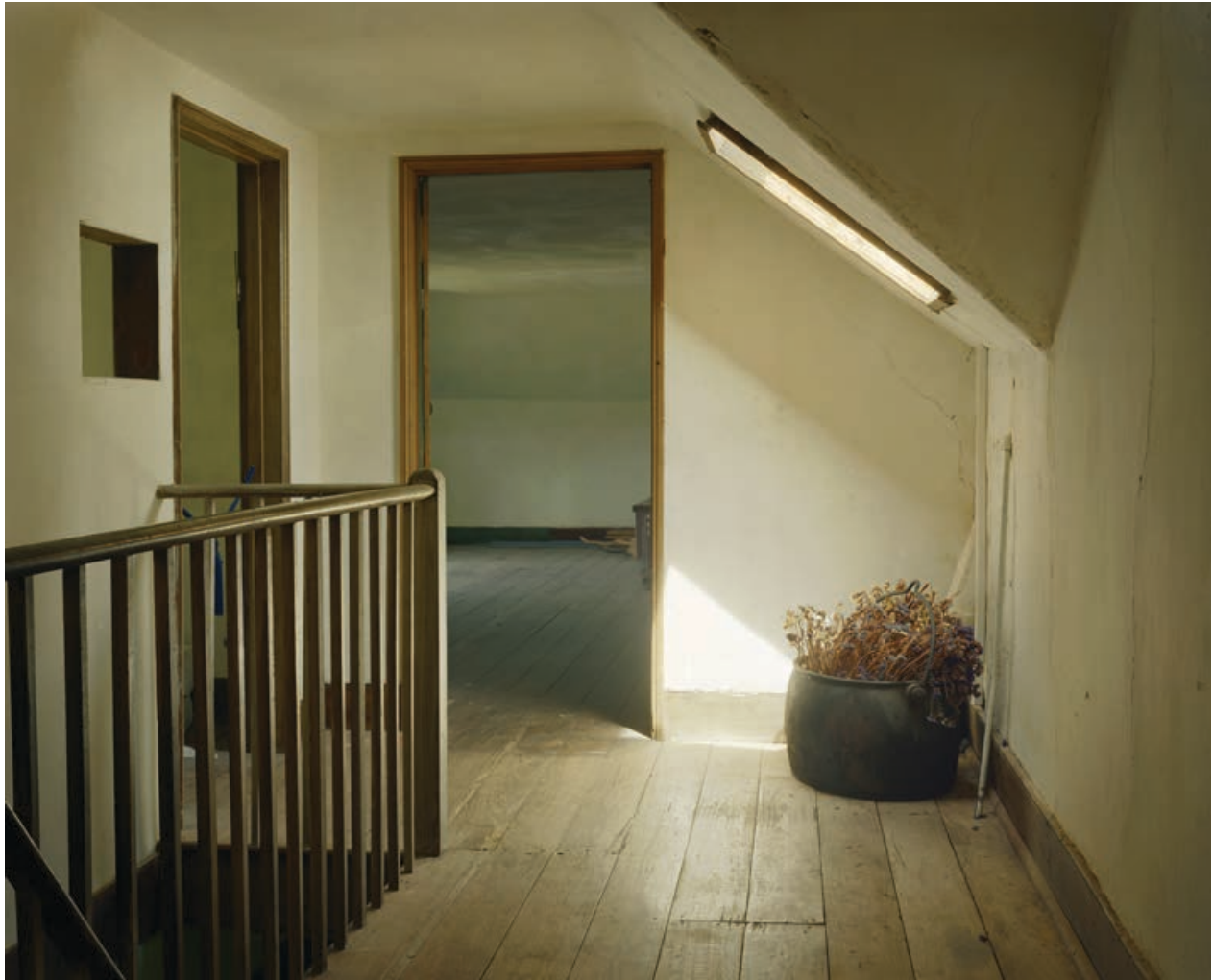
Space S18 – Attic Stair (from the series Oak Lodge )