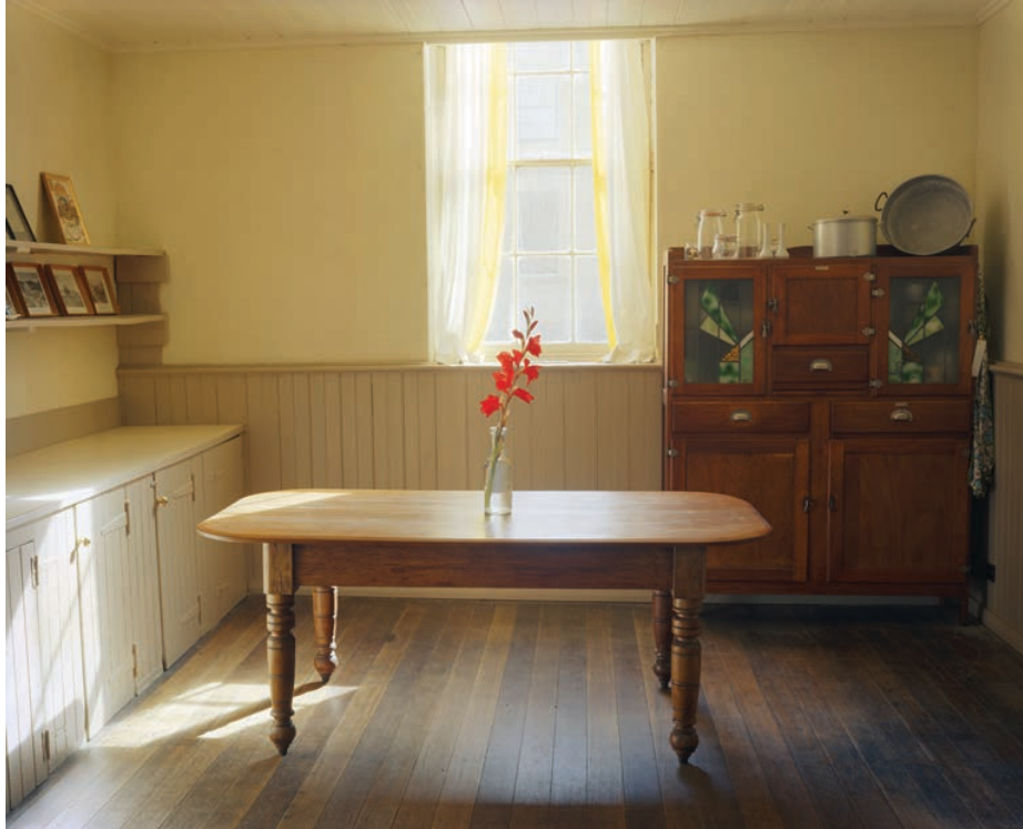
Space S4 – Kitchen (from the series Oak Lodge ) 2009 Archival pigment print 74 x 60 cm