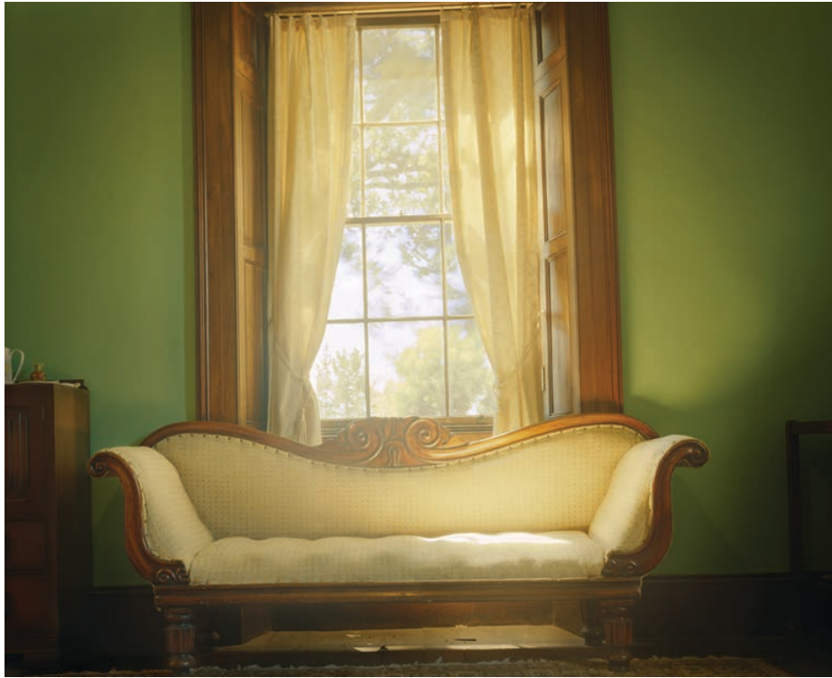
Space S3 – Parlour (East) (from the series Oak Lodge ) 2009 Archival pigment print 74 x 60 cm