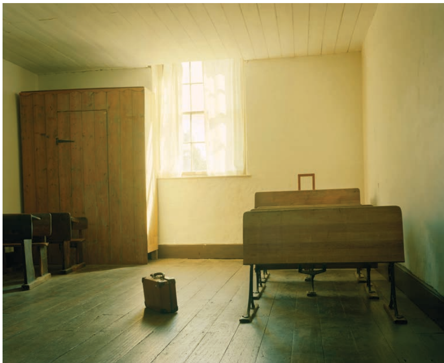
Space S15 – Chamber Room (from the series Oak Lodge ) 2009 Archival pigment print 74 x 60 cm