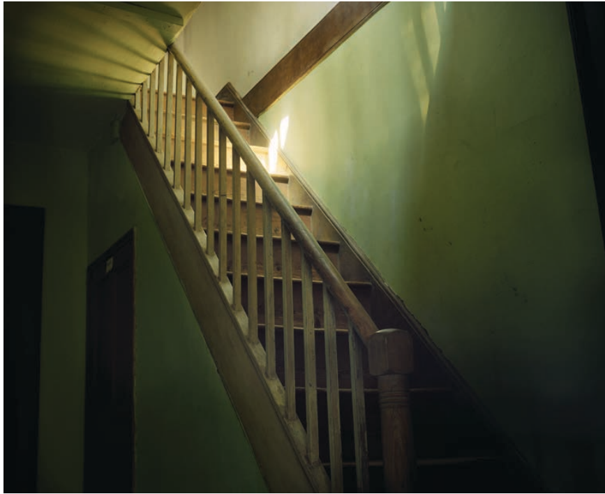
Space S14 – Stair Hall First Floor (from the series Oak Lodge ) 2009 Archival pigment print 74 x 60 cm