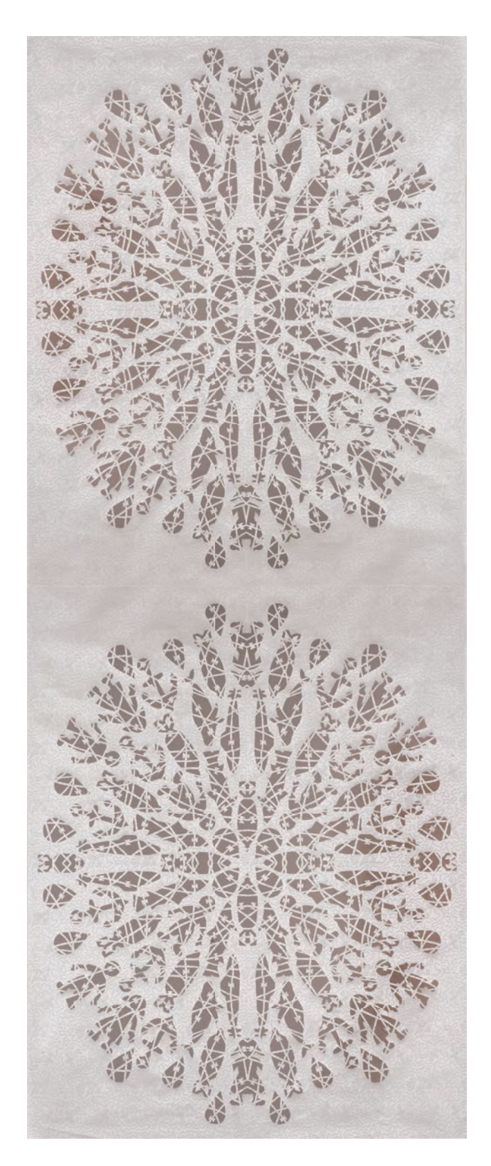
Shallow Pool #2 (From the series Deep water, Dark water) 2007 Hand cut silk paper 200 x 90 cm