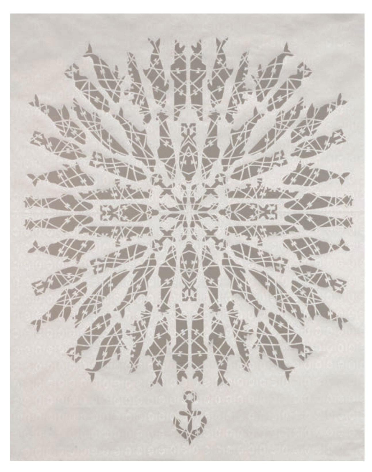
Silk Cut #12 (From the series Deep water, Dark water) 2007 Hand cut silk paper 100 x 80 cm