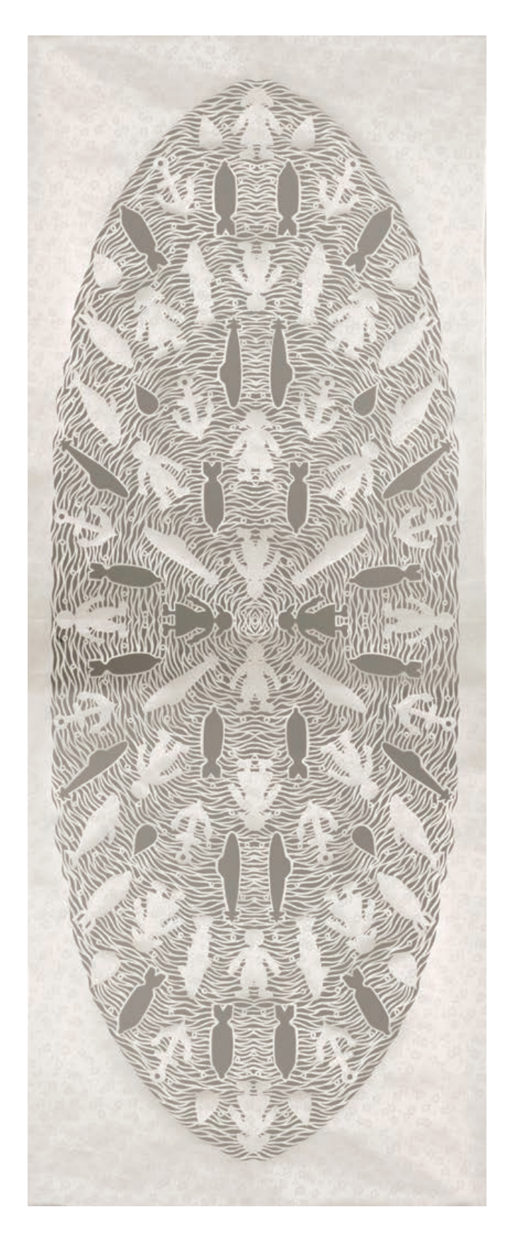
Shallow Pool #1 (From the series Deep water, Dark water) 2007 Hand cut silk paper 200 x 90 cm