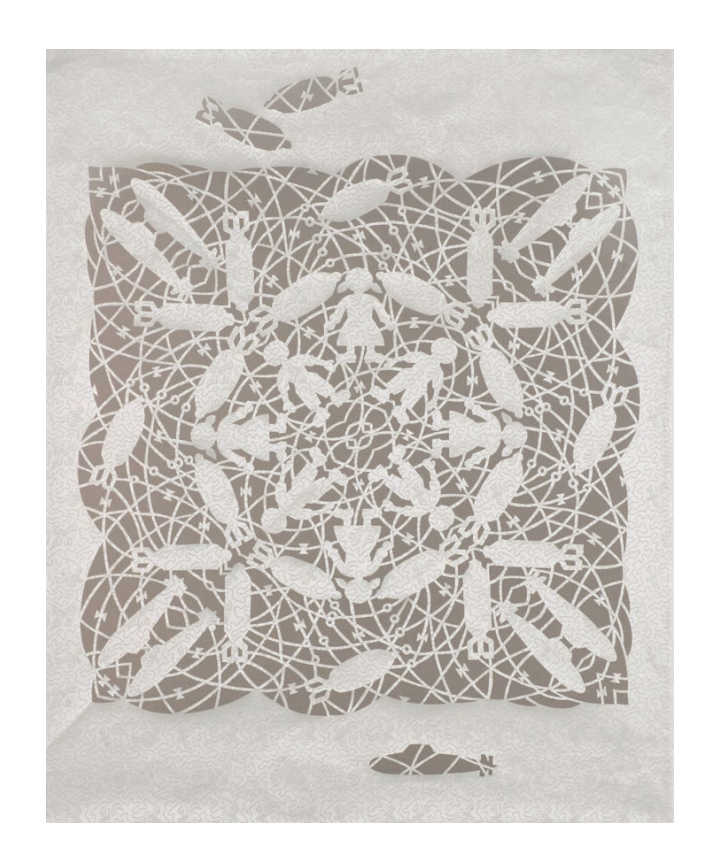
Silk Cut #1 (From the series Deep water, Dark water) 2007 Hand cut silk paper 100 x 80 cm