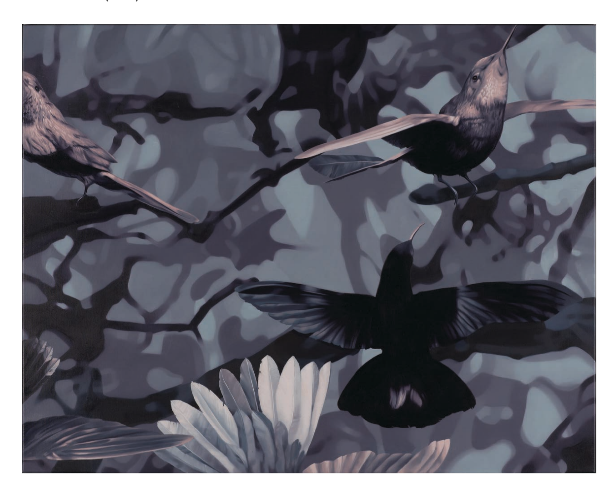
Untitled #1 (the keeping room) 2009 Oil on linen 112 x 112 cm