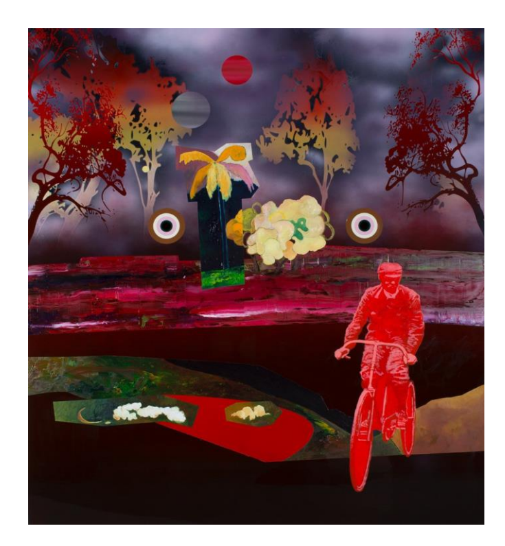
Haddon, N. The Visit , 2018, oil, enamel and clear coat on aluminium panel, 180 cm x 150 cm