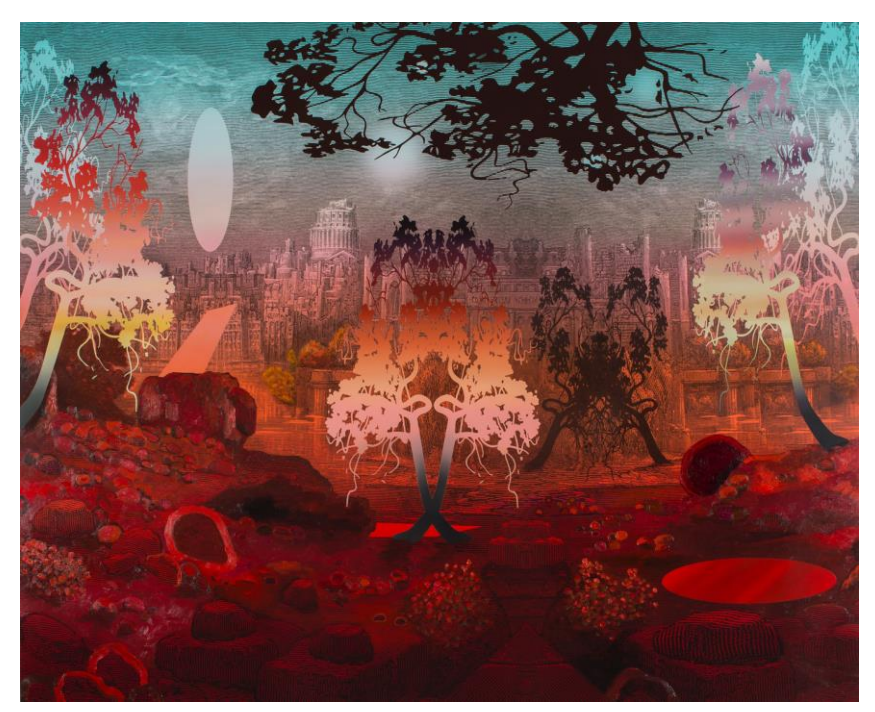
Haddon, N. The land will healitself , 2018, enamel, oil and digital print on aluminiumpanel, 122 cm x 150 cm