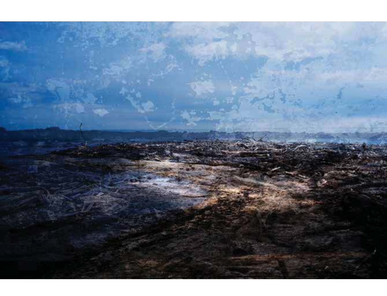
Remains of day, digital print on composite aluminium sheet, 2017