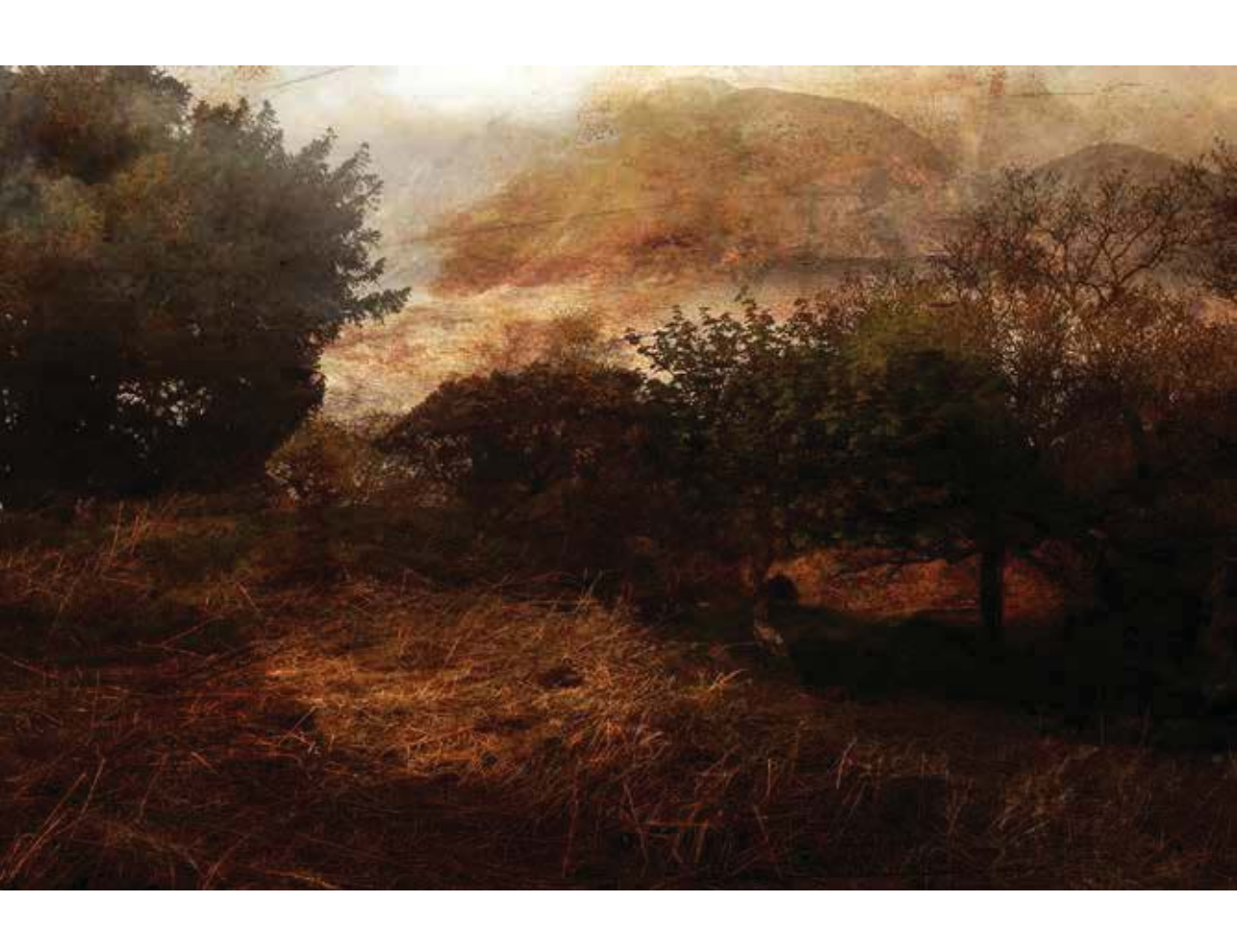
Between earth and it's noun, digital print on composite aluminium sheet, 2017