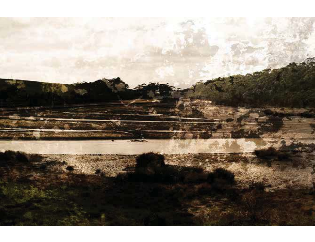
Tidal, digital print on composite aluminium sheet, 2017