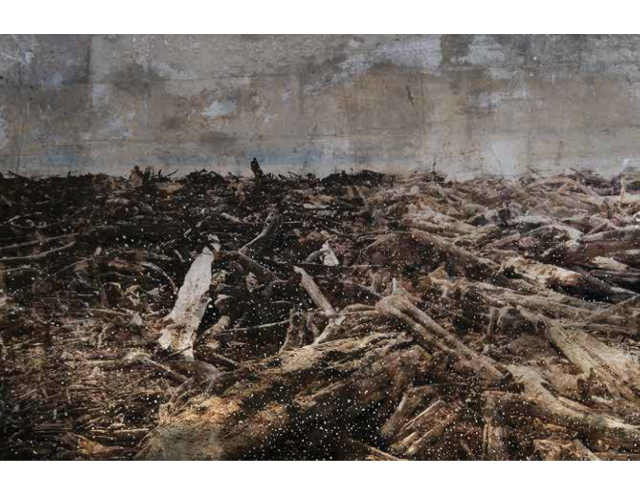
Inundation and flood, digital print on composite aluminium sheet, 2017