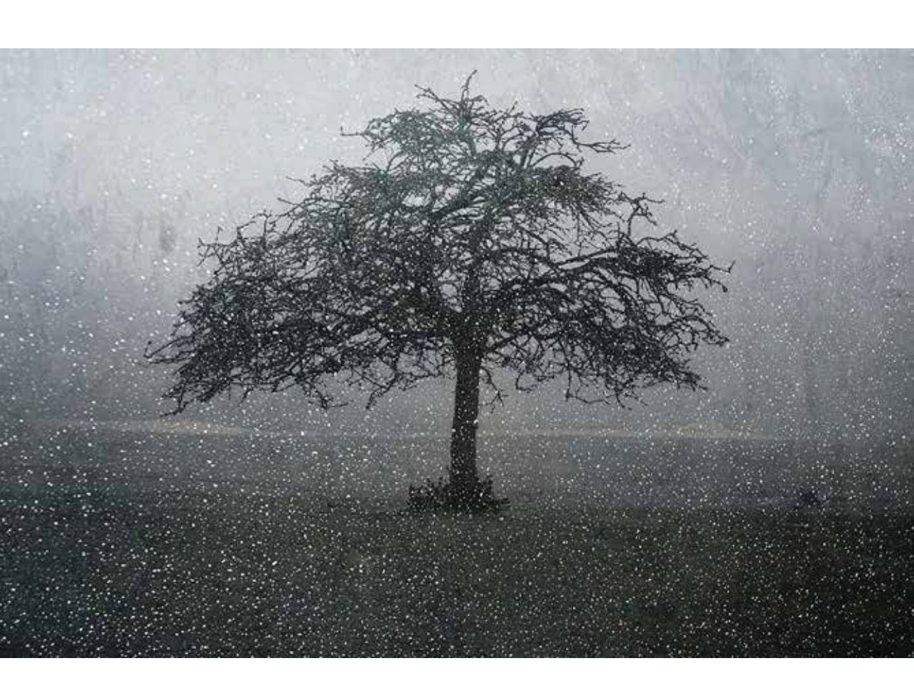
Interval #3, digital print on composite aluminium sheet, 2017