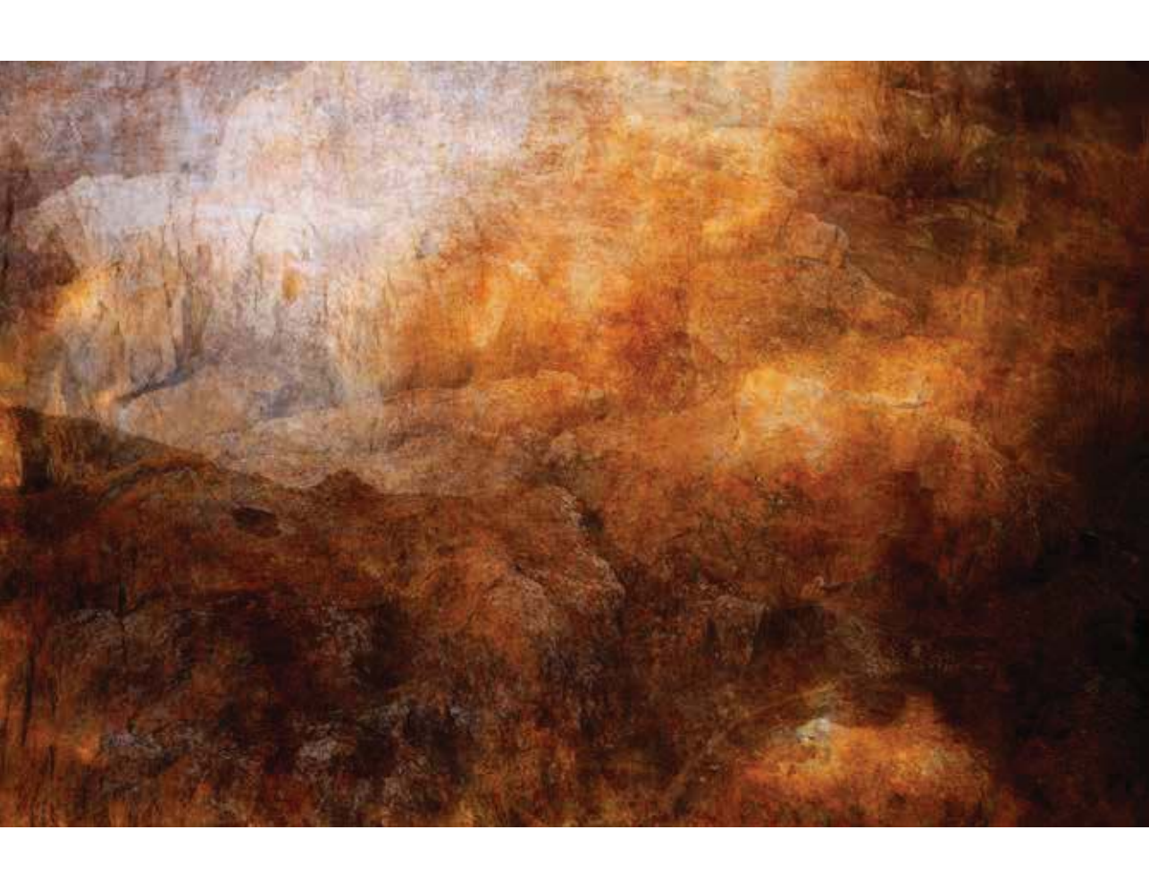
Luminous Worlds, digital print on composite aluminium sheet, 2017