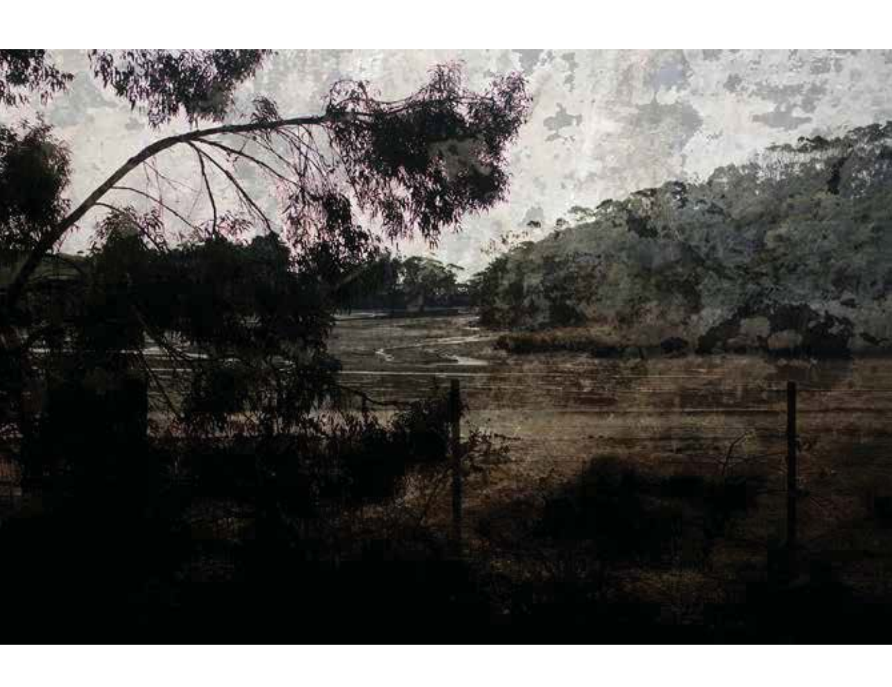
Constellations, digital print on composite aluminium sheet, 2017