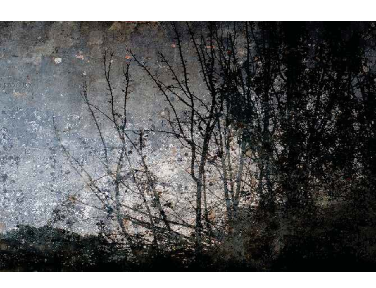
A sky by nature skyless, digital print on composite aluminium sheet, 2017