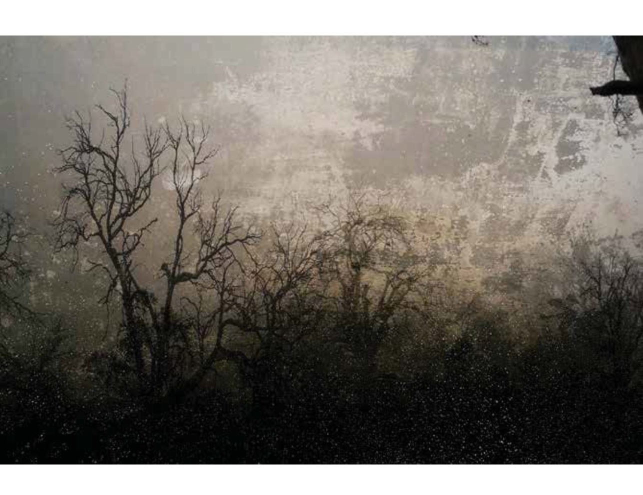
As night falls, digital print on composite aluminium sheet, 2017