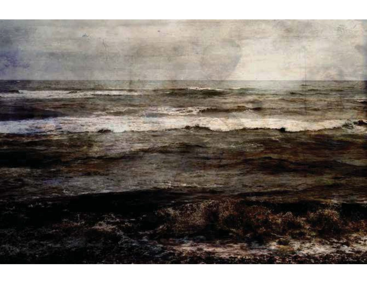
Low Sky, digital print on composite aluminium sheet, 2017