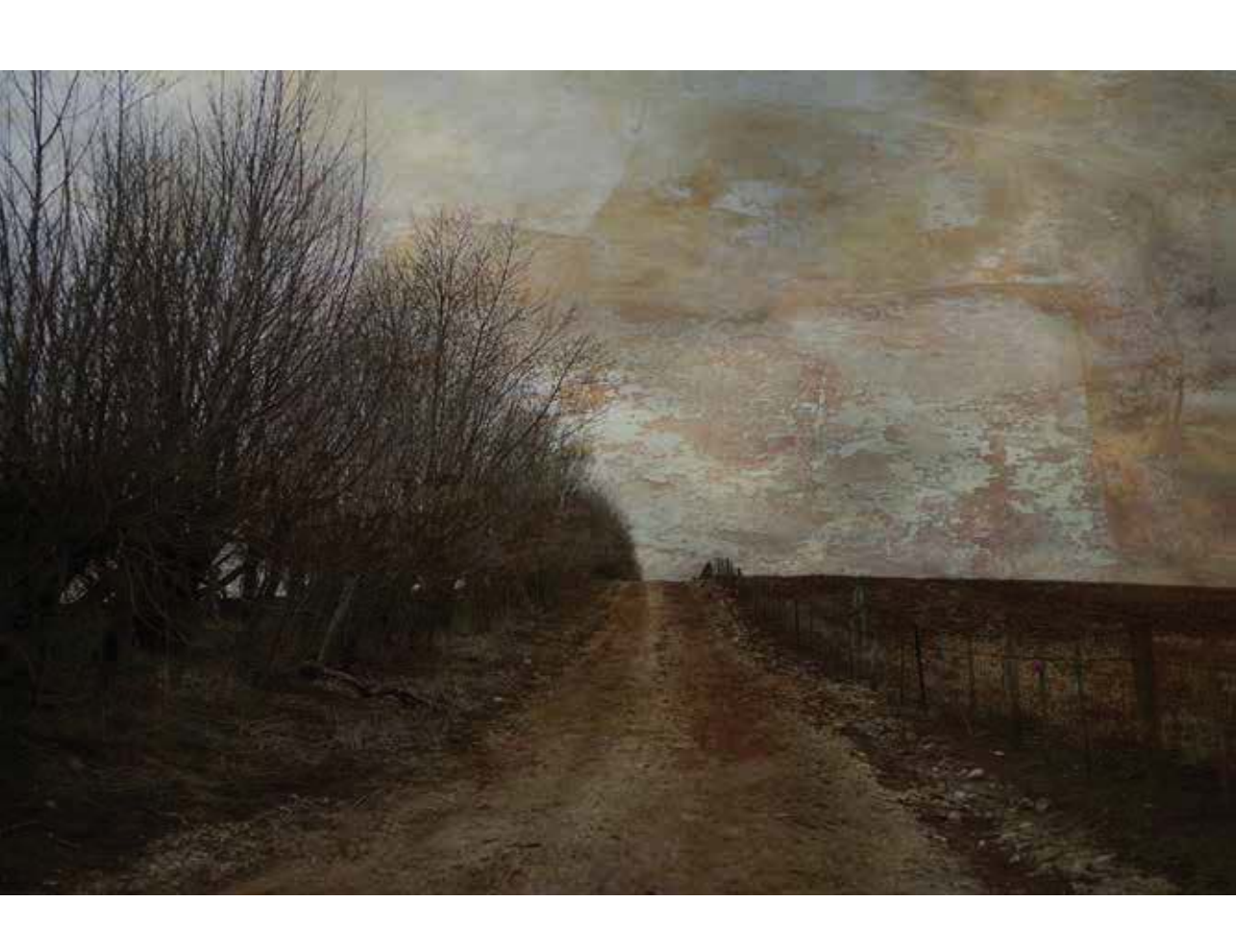
Passage, digital print on composite aluminium sheet, 2017