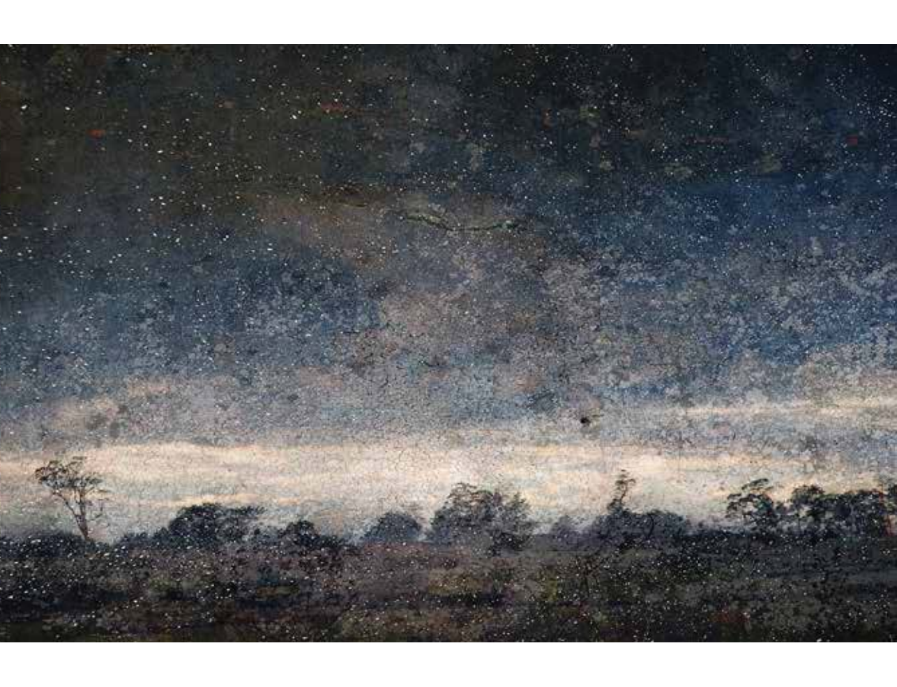
Interval #4, digital print on composite aluminium sheet, 2017