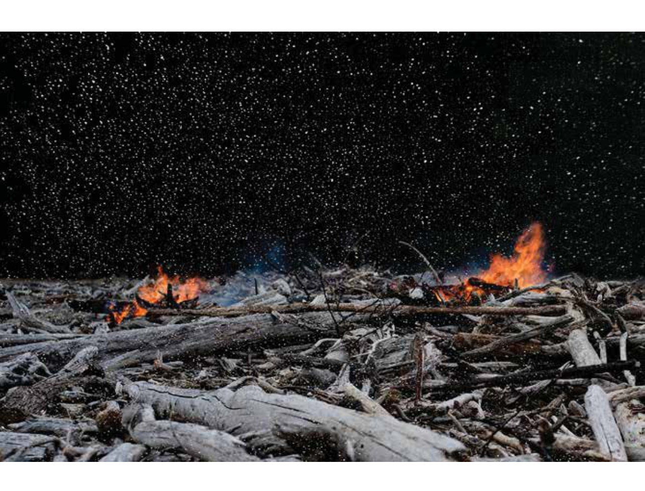
The bone gardens, digital print on composite aluminium sheet, 2017