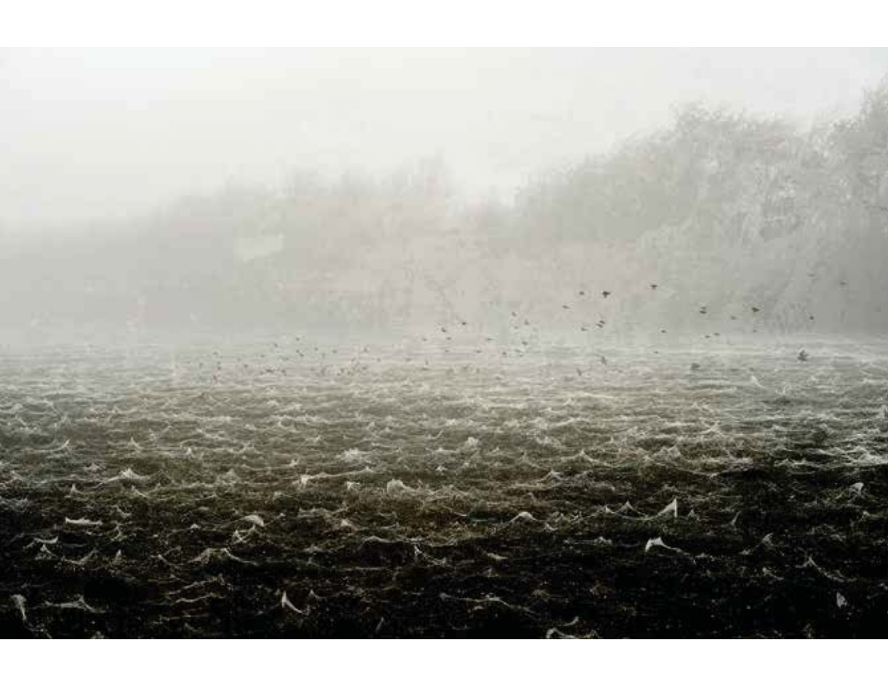
The intervals of distance #2, digital print on composite aluminium sheet, 2017