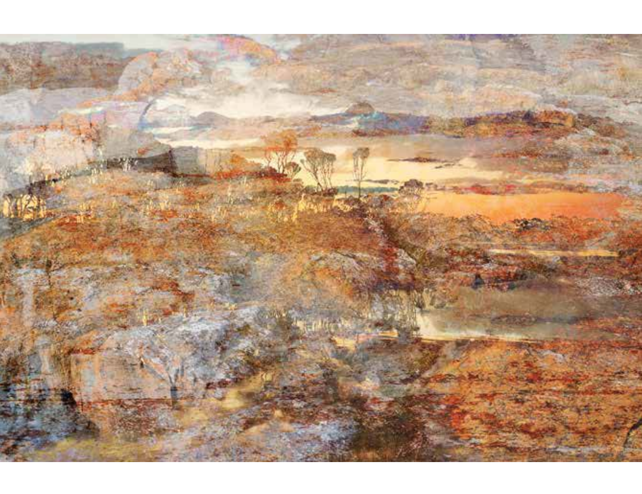
A sky's archaeology, digital print on composite aluminium sheet, 2017