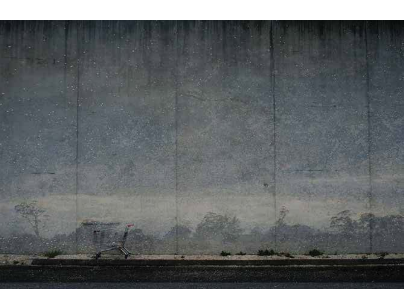
Found song, digital print on composite aluminium sheet, 2017