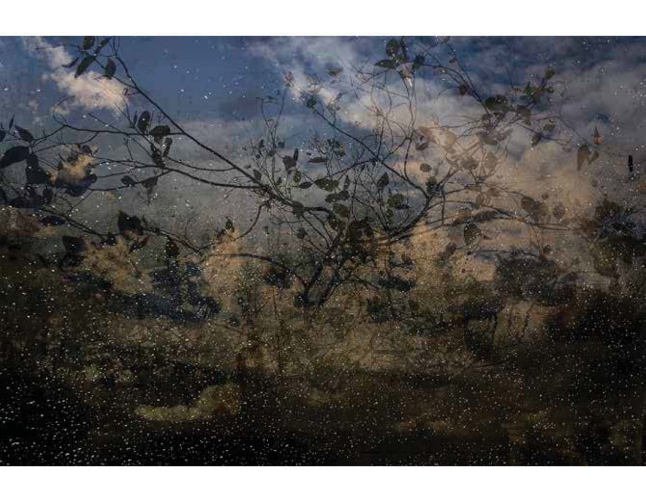
Eucalyptus Sky, digital print on composite aluminium sheet, 2017