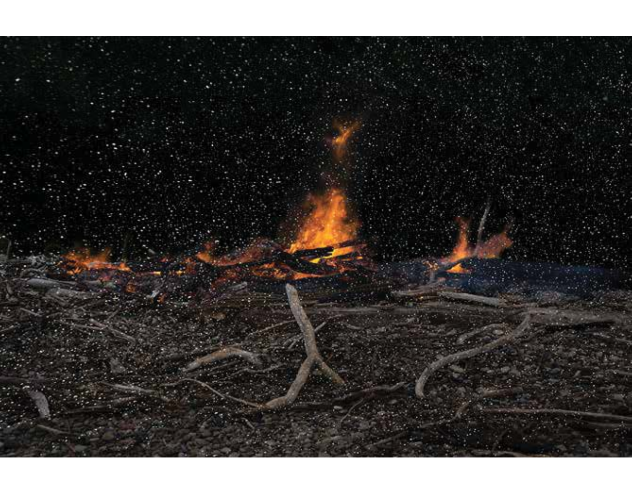
After the flood, digital print on composite aluminium sheet, 2017