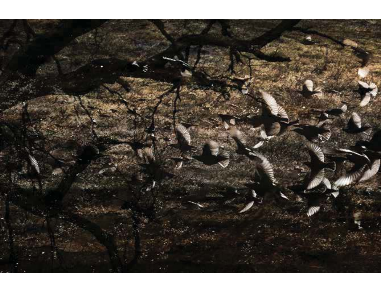
Interval #1, digital print on composite aluminium sheet, 2017