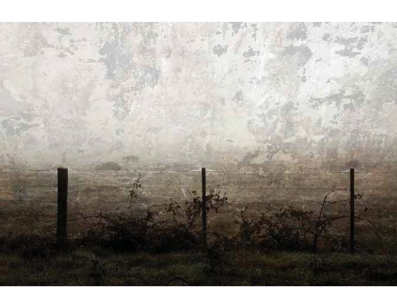
Interval #2, digital print on composite aluminium sheet, 2017