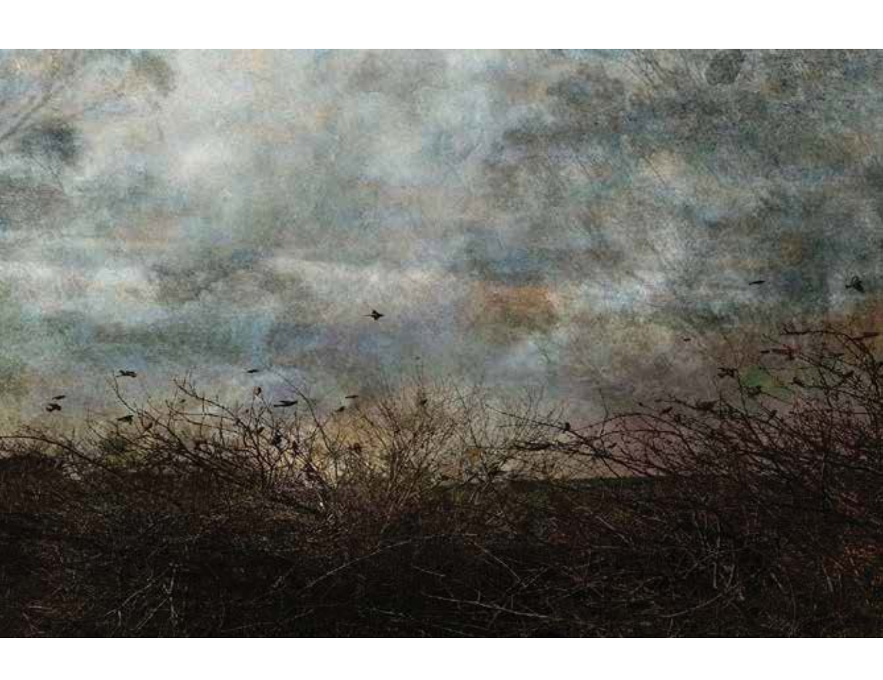
Finches, digital print on composite aluminium sheet, 2017