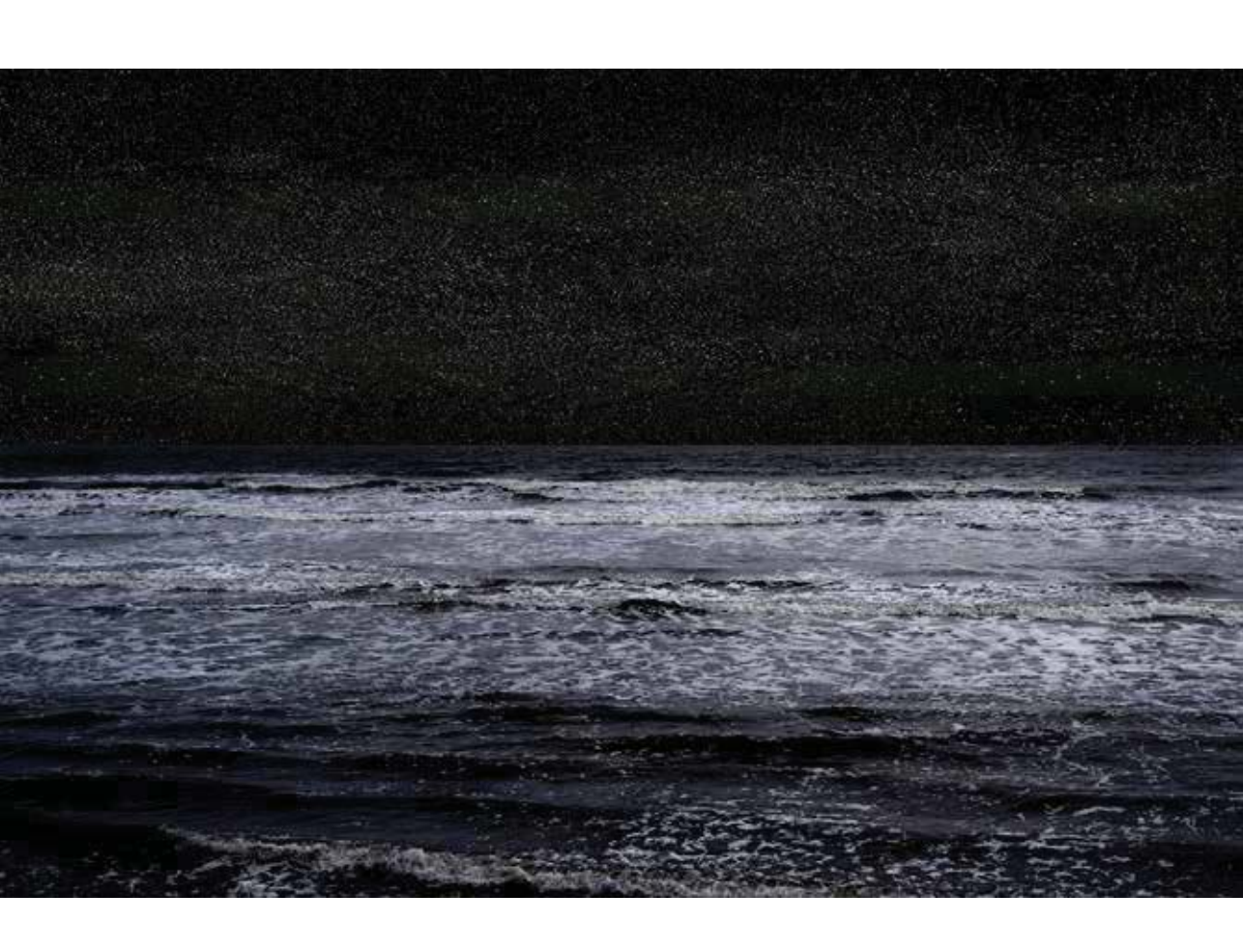
Compass, digital print on composite aluminium sheet, 2017