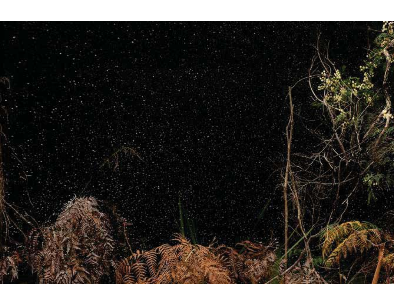
Understory, digital print on composite aluminium sheet, 2017