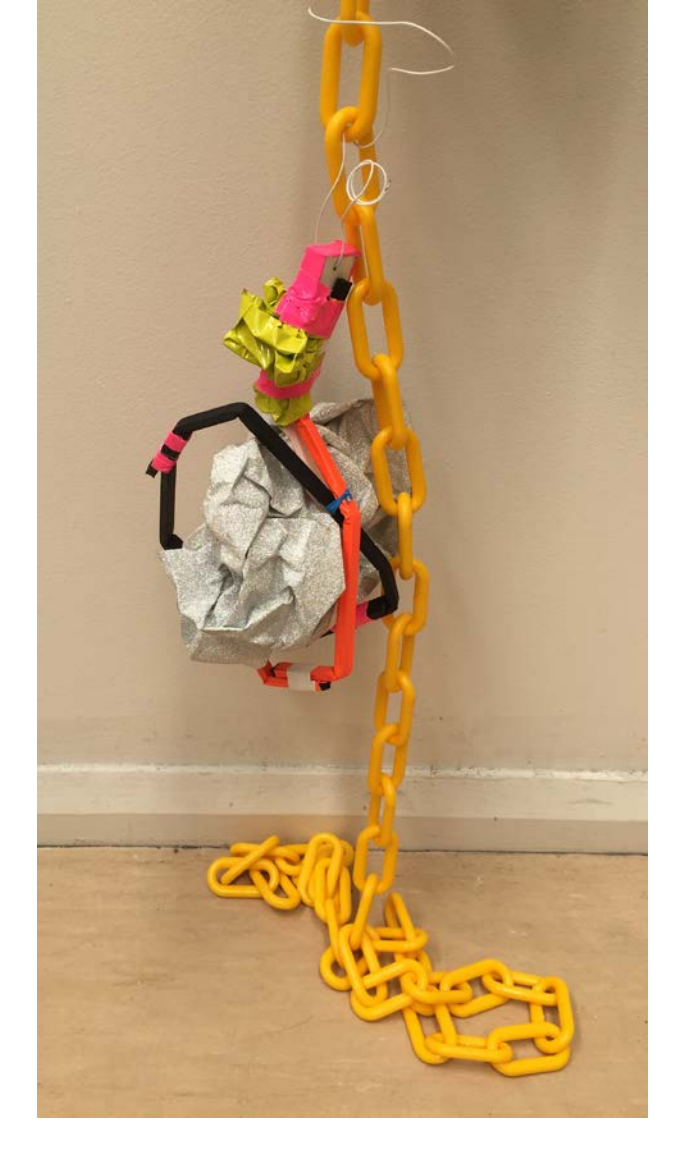
Steven Carson – Debris Improvisation 6 , 2018.

Wood, paper, wire, adhesive tape and foam core. 340mm (H) x 130mm (W) x 140mm (D).