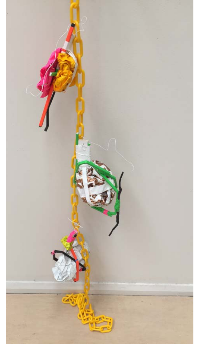
Steven Carson – Installation view: Debris Improvisations 4, 5, 6 , 2018.

Wood, paper, wire, adhesive tape and foam core. 340mm (H) x 130mm (W) x 140mm (D).