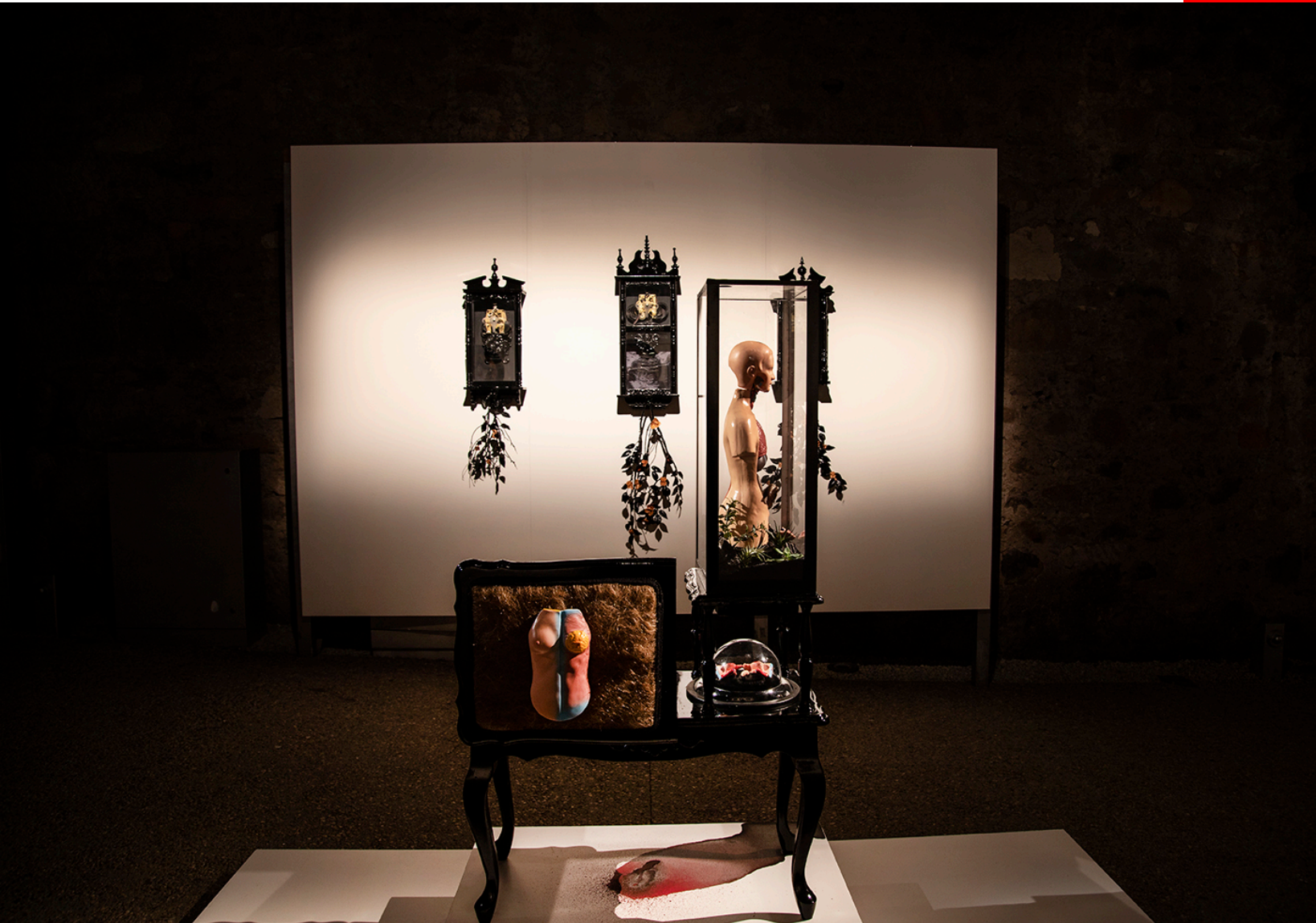
Svenja Kratz Time is Topological , 2020 Mixed media Installation view