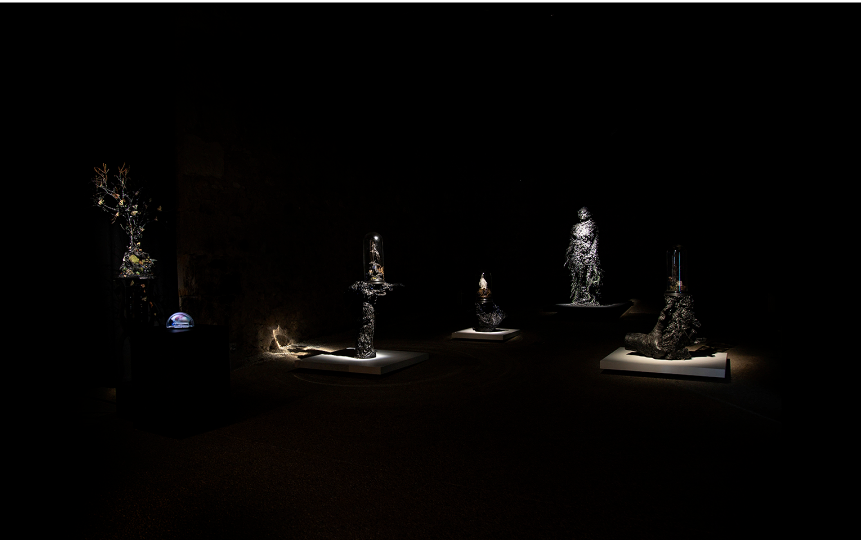
Exhibition view: Rosny Barn