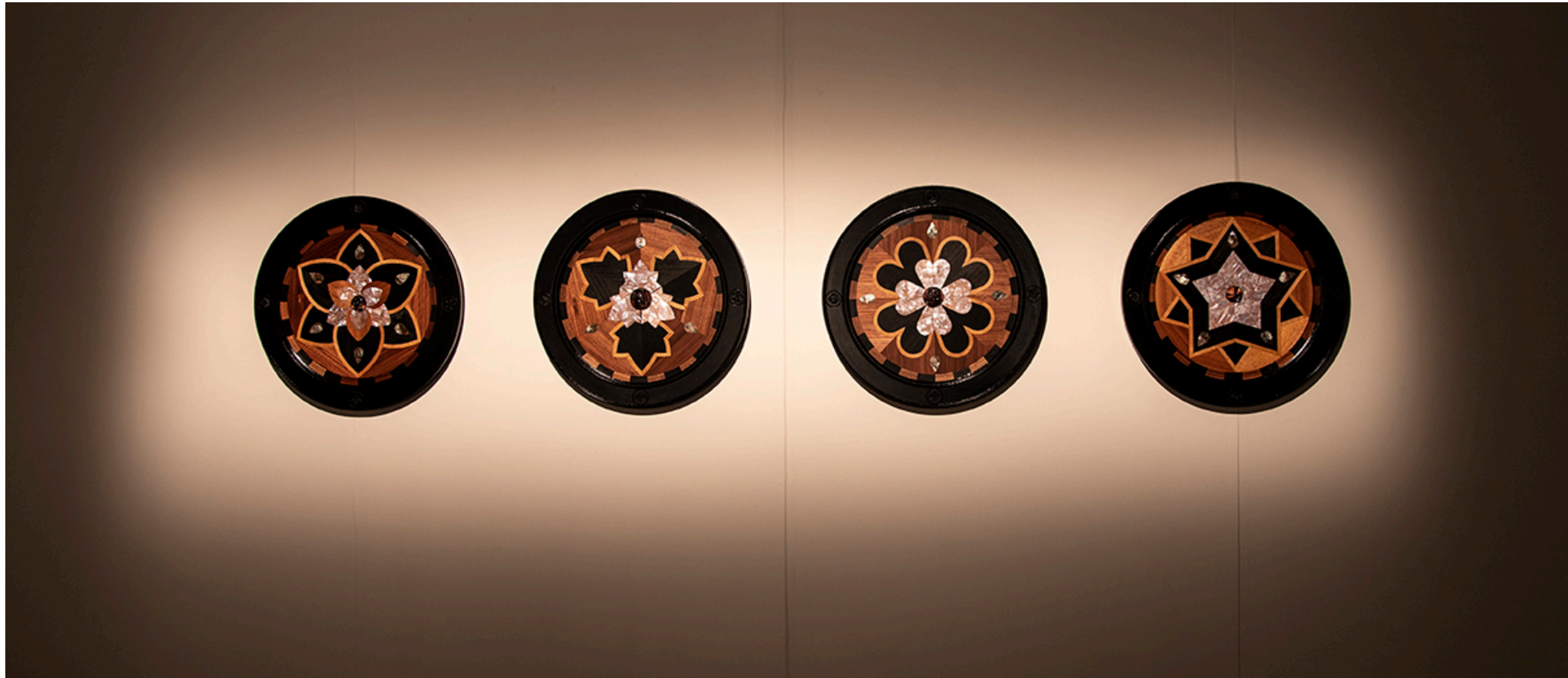
Svenja Kratz, Anita Gowers and Phil Blacklow Blood Floriography , 2020 Mixed media Installation view