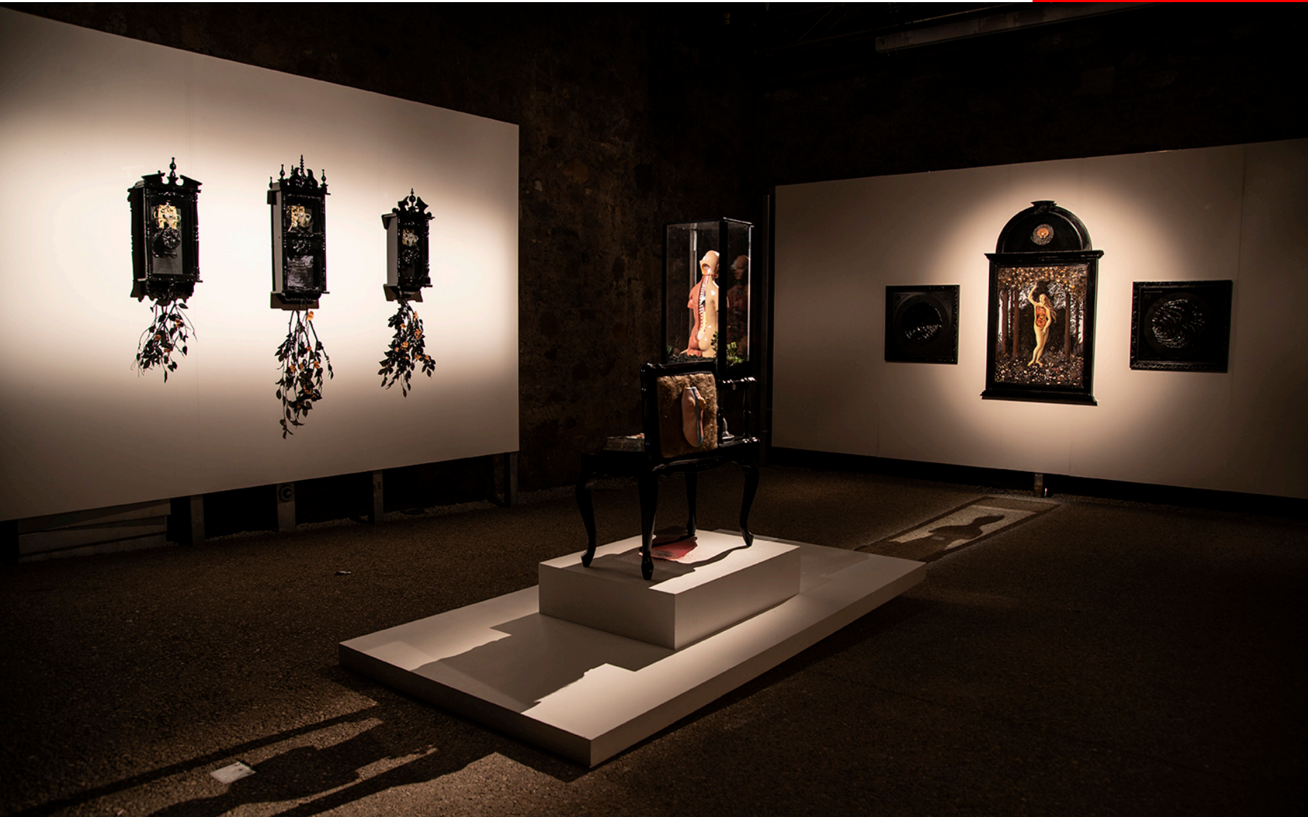
Exhibition view: Rosny Barn