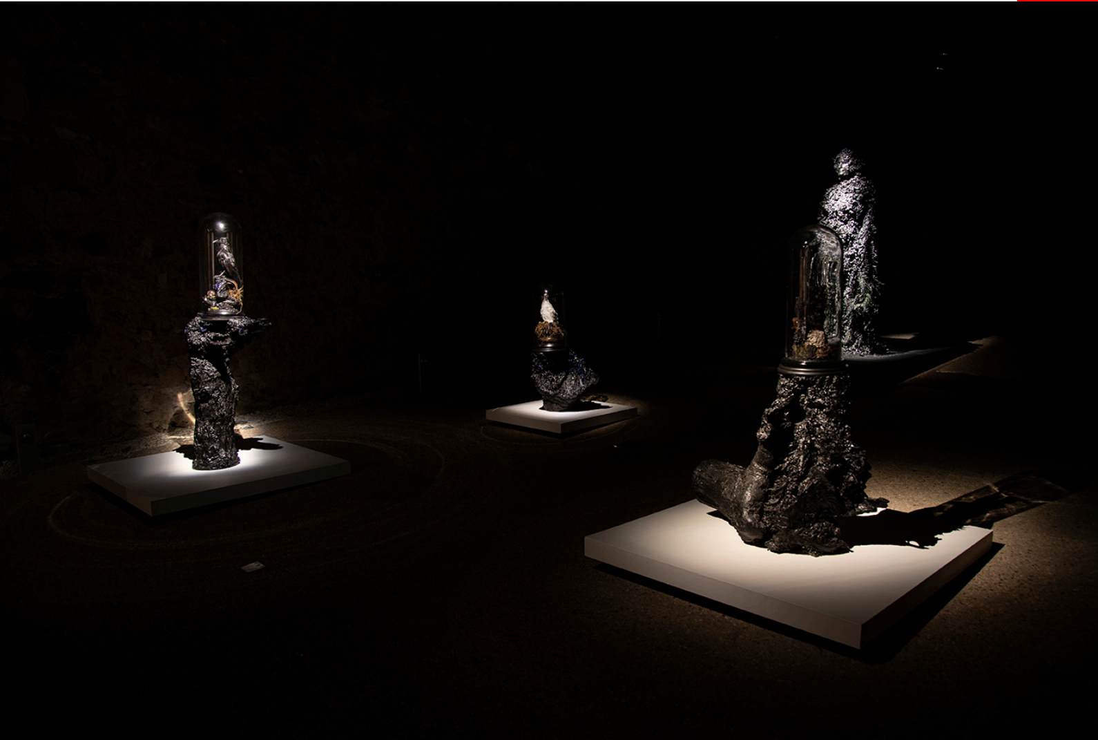
Exhibition view: Rosny Barn