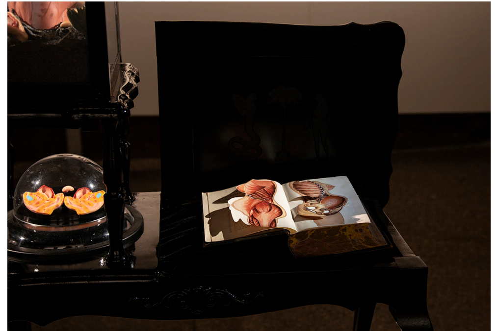
Svenja Kratz Time is Topological , 2020 Mixed media Detail of anatomical models