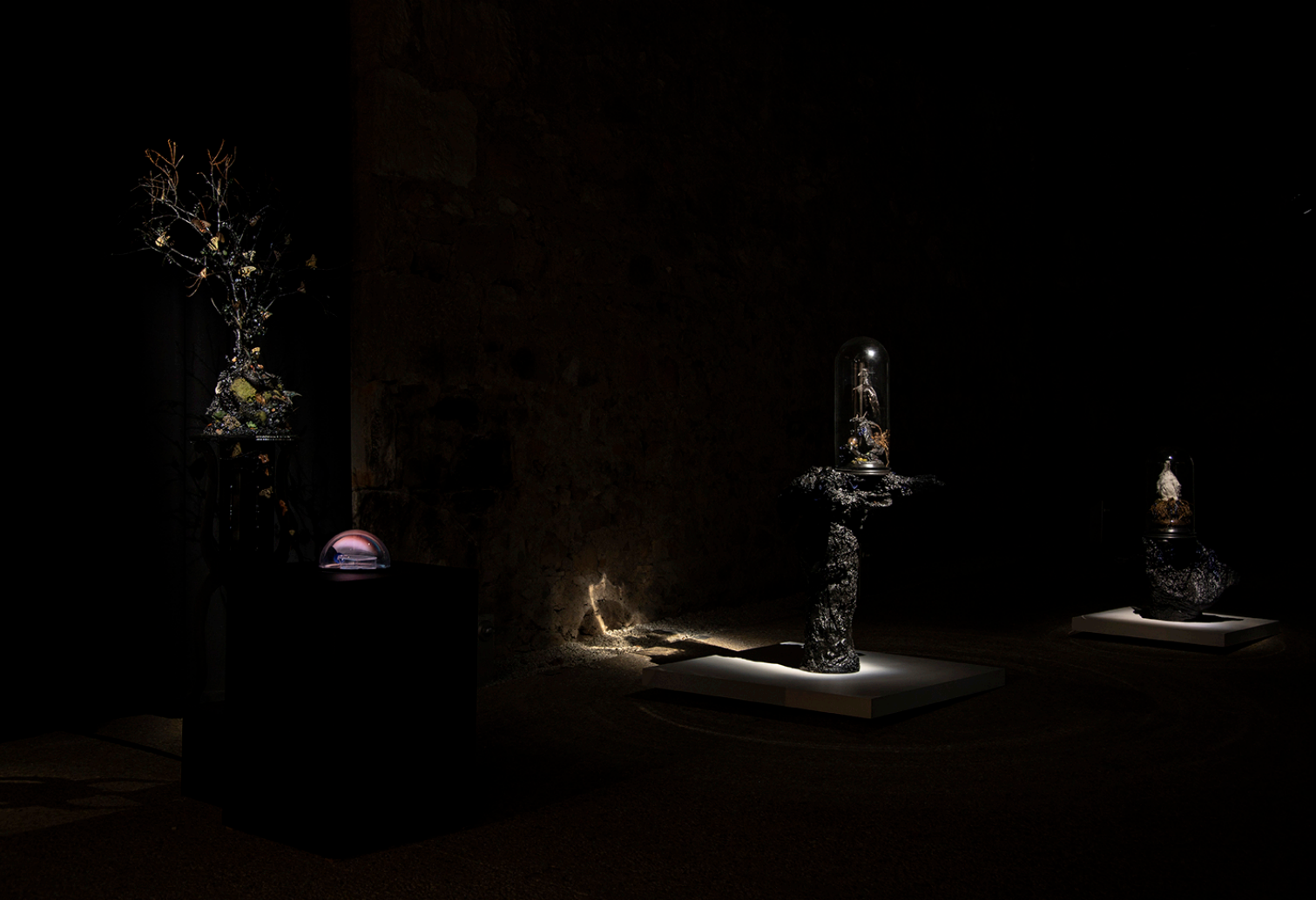
Exhibition view: Rosny Barn