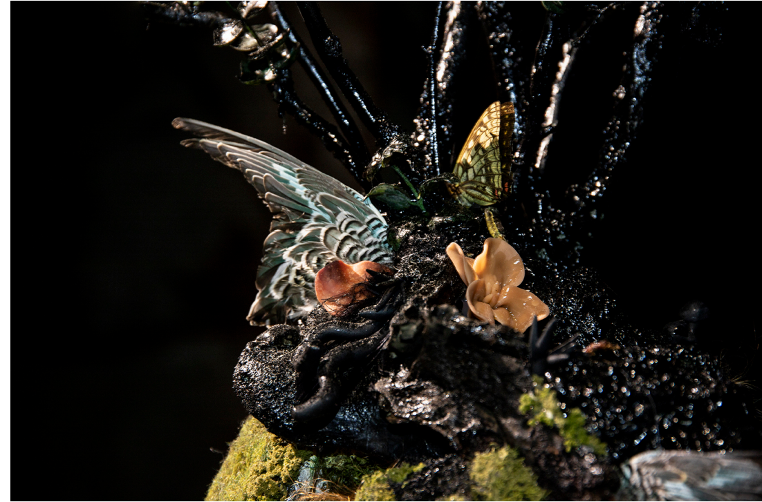
Svenja Kratz SVKR-LM: Tumour Baby , 2020 Mixed media with video Detail of sculptural elements