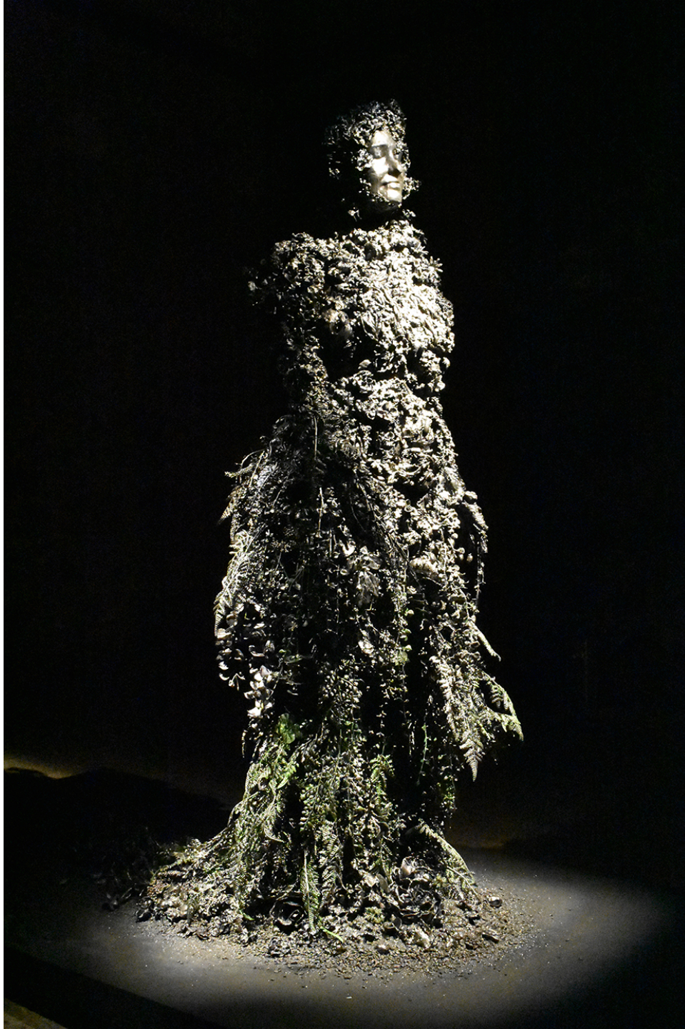
Svenja Kratz Coming to terms with being forgotten , 2020 Mixed media Installation view