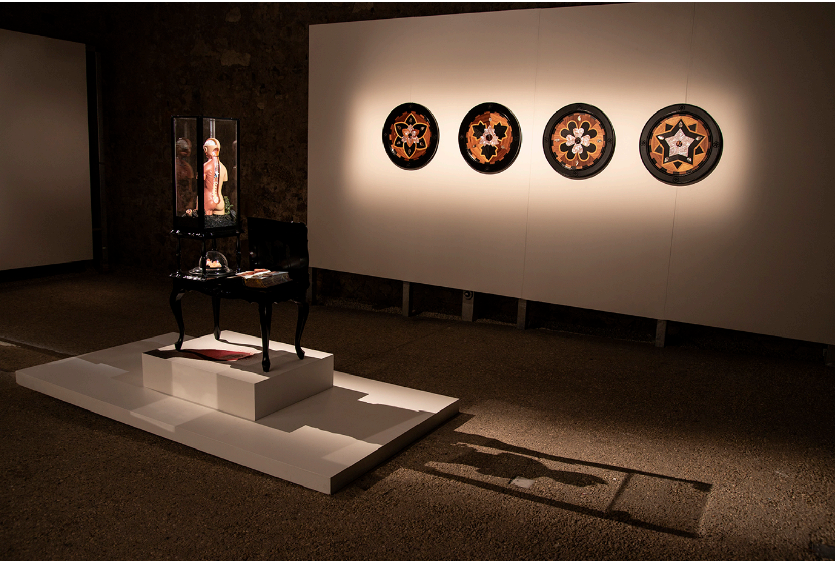
Svenja Kratz Time is Topological , 2020 Mixed media Installation view