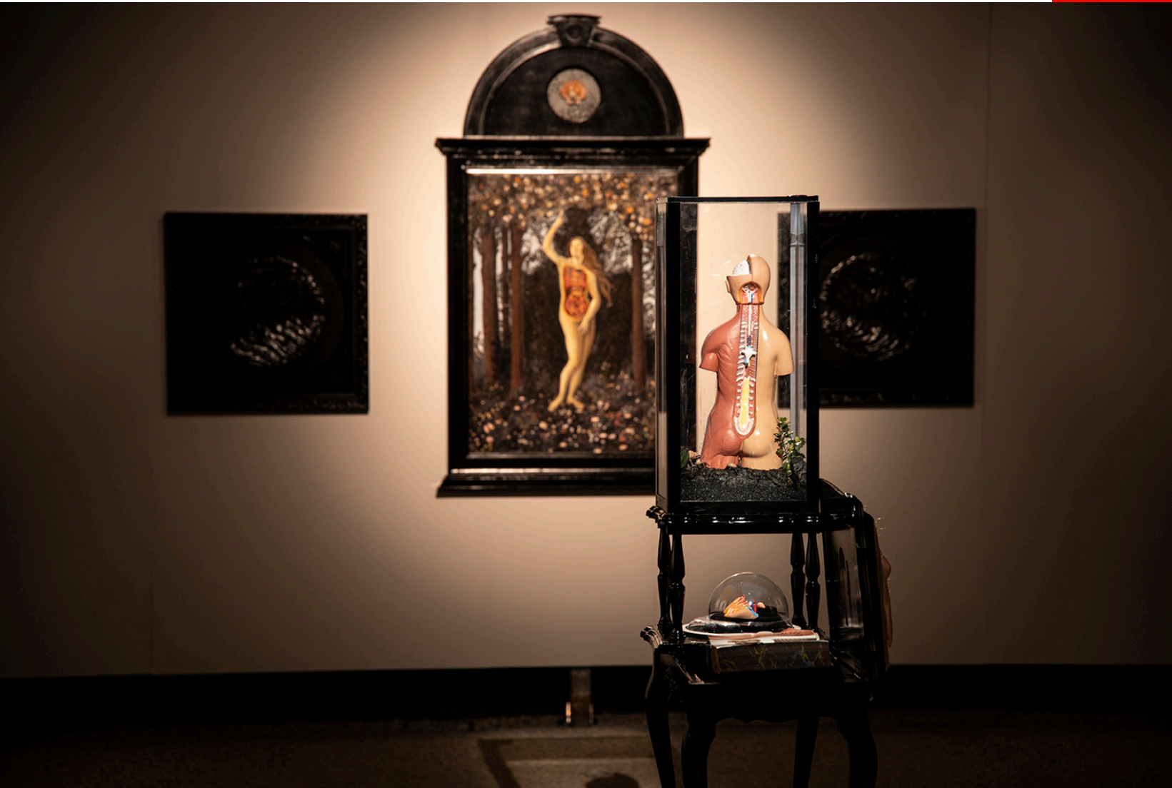
Svenja Kratz Time is Topological , 2020 Mixed media Installation view