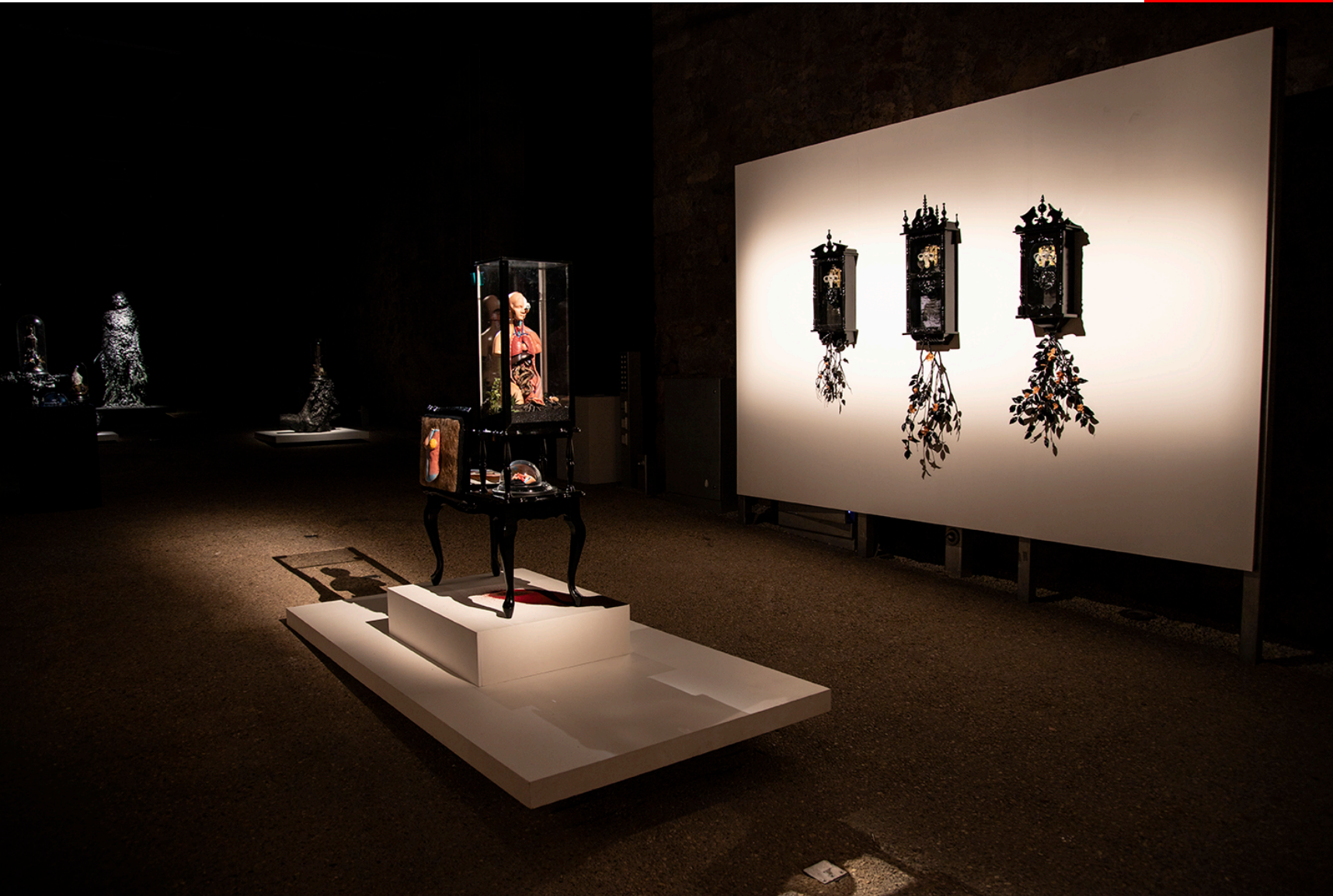
Svenja Kratz Time is Topological , 2020 Mixed media Installation view