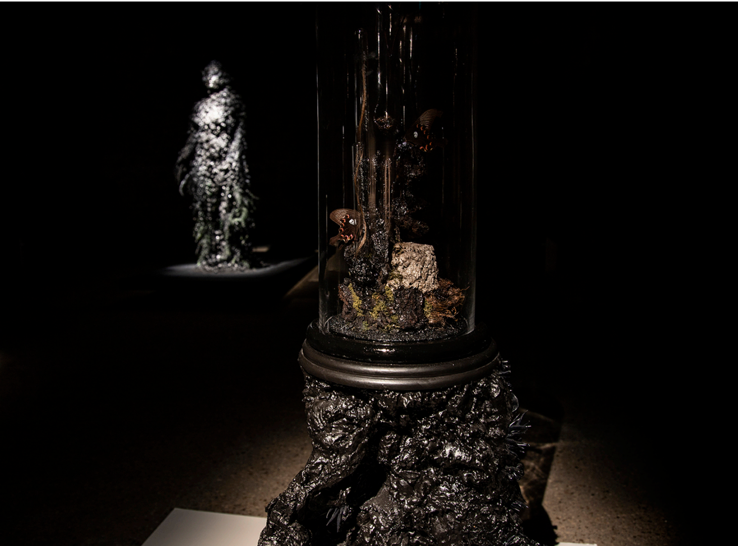
Svenja Kratz Memento Mori: Transformation [All endings are beginnings - All beginnings are endings] , 2020 Mixed media Installation view