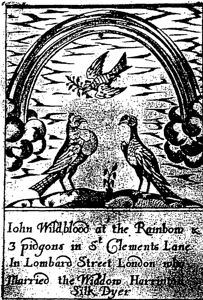
Figure 1 Undated tradecard, from a reproduction held by the Bodleian Library, John Johnson Collection, Trade Cards 12 (96). Reproduced courtesy of the Bodleian Library, University of Oxford.

seen as female preserves, such as the early modern building trades. 2 This study starts its search for women's enterprise in an even less obvious location: the dockyards. Case studies help us to establish the presence of women in the areas of long-distance trade, heavy industry, and high finance in the early industrial era in the British Isles and to investigate whether and why women moved out of these areas and how we can assess their significance.