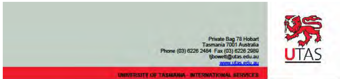
Figure 25. Letter to Japanese academics from the Head of the School of Geography and Environmental Studies, University of Tasmania, inviting participation in the research project (Japanese version).