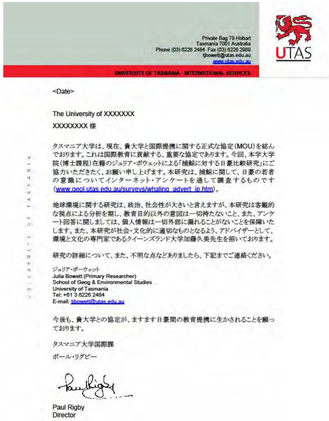
Figure 26. Letter to Japanese academics from the Director of International Services, University of Tasmania, inviting participation in the research project (Japanese version).