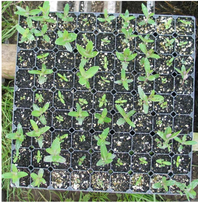
Photo 5. Variable germination of E. globulus seed can result in large variation in seedling size within the same nursery tray and result in a high percentage of seedlings being discarded as they do not meet planting specifications.