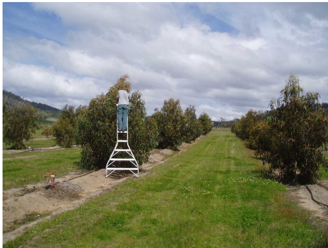
Photo 4. Eucalyptus globulus grafted seed orchard near Hobart, Tasmania.

(a) The orchard was established by seedEnergy Pty Ltd for the large-scale production of elite E. globulus full-sib family seed for deployment using mass supplementary pollination (MSP). Genotypes in the orchard are selections from the STBA National E. globulus breeding population. (b) Operators pollinate all flowers on the trees on a weekly cycle using the cut style technique (Photo 3) and all capsules on the tree are subsequently harvested. The study of Patterson et al. (2004a) suggest that the target pollinations are likely to comprise 87% of the seed obtained, the remainder being selfs (4.6%) and presumably high quality outcrosses from other selected genotypes in the orchard (8.4%). Selfing can be eliminated completely when self-incompatible genotypes are used as females.