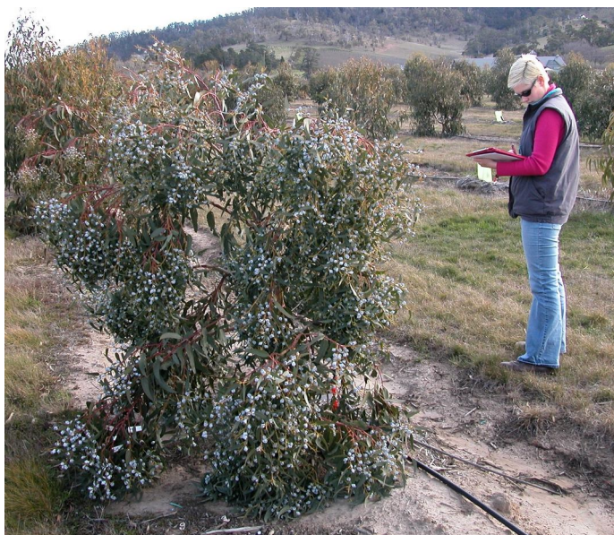
Photo 2. The enhanced flower bud production and reduced vegetative growth evident following paclobutrazol application to grafted trees of E. globulus .

The tree shown has an atypically high flower bud load for the vegetative canopy size. While flower bud abundance is enhanced, there is evidence that capsule abortion rates increase with paclobutrazol application, no doubt due to the larger reproductive crops.