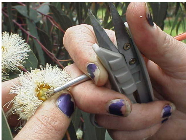
Photo 3. The OSP/SVP cut-style pollination technique used by seedEnergy Pty Ltd for the production of mass supplementary pollinated (MSP) seed of elite full-sib E. globulus families for family forestry.

The MSP technique involves (a) transversely cutting the style with small scissors 1-2mm below the stigma to maximise the surface area of the transmission tissue for pollen application and then (b) applying pollen to the freshly cut surface with a small paint brush. Styles are cut on flowers ranging in development from operculum shed to 1 week later, and all suitable flowers on a tree are pollinated on a weekly cycle. Flowers are not emasculated, nor are they isolated or labelled which considerably reduces labour costs.