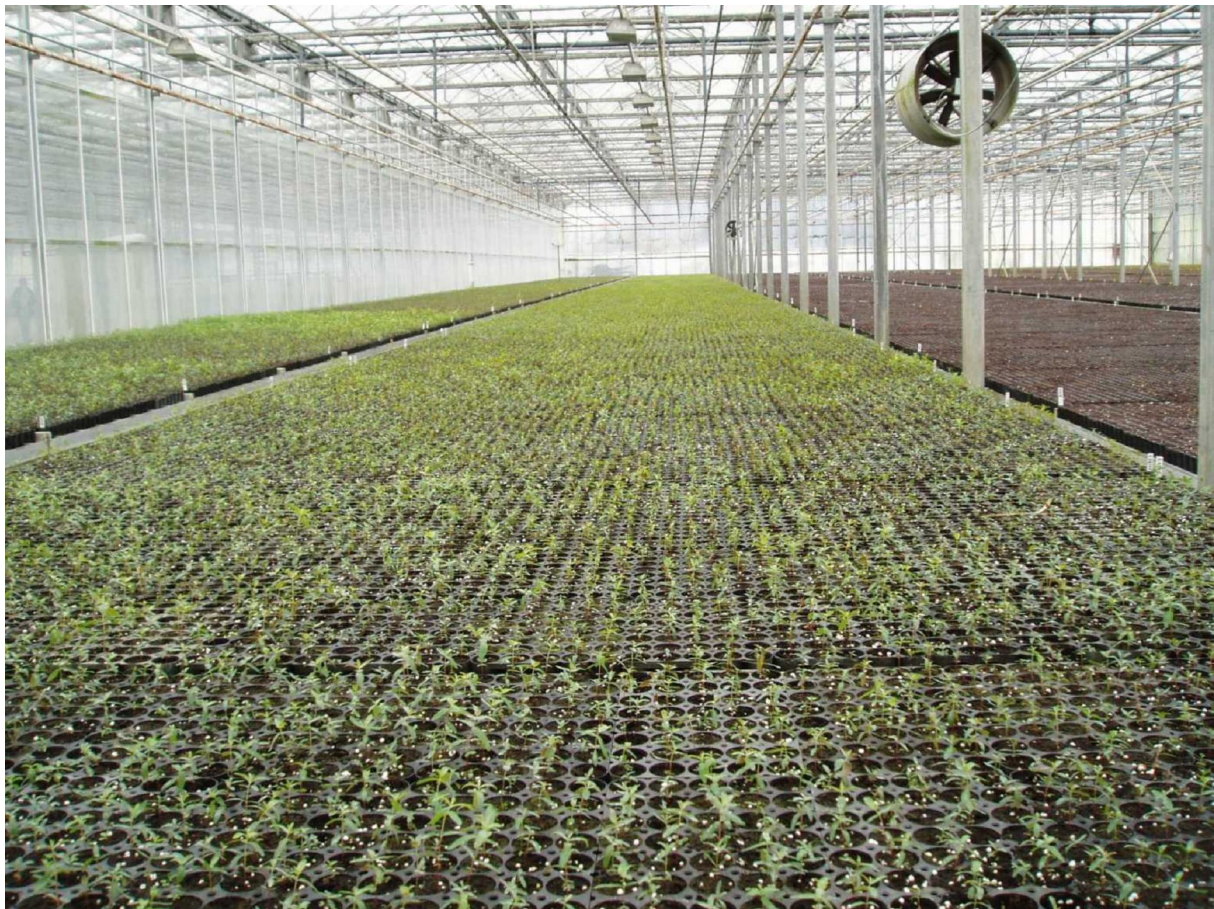
Photo 6. Eucalyptus globulus seedlings growing in the Storaenso nursery at Furadouro, Portugal. In 2004, this nursery was producing approximately 7 million plants per year, 3.5 million of which were E. globulus .