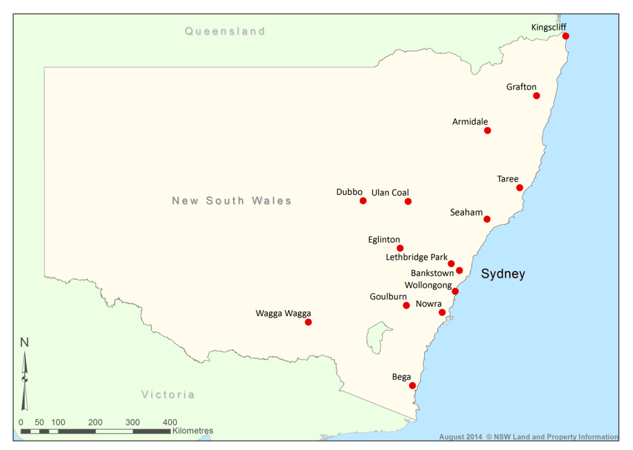
Figure 1: Location of current EDM baselines in New South Wales.

Proceedings of the 20<sup>th</sup> Association of Public Authority Surveyors Conference (APAS2015) Coffs Harbour, New South Wales, Australia, 16-18 March 2015