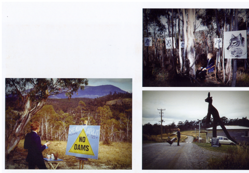
Geoff Parr Place II , 1983/88, photo transparencies, 6 light units, each 71 x 90 cm (detail)

Parr engaged in activism during the Franklin campaign, contributing strategic political advice as well as photographs for reproduction in books and on posters to raise public awareness about the environmental cost of the proposed dam. In 1983 he was arrested and charged along with some 80 other artists and art students who staged a blockade in Queenstown of a supply road to the proposed dam site. Parr has now retired from both teaching and politics and primarily dedicates himself to his art practice, though he is still active in the arts community through such activities as supervising research higher degree candidates at the art school and as Chair of the board of Contemporary Art Services Tasmania.