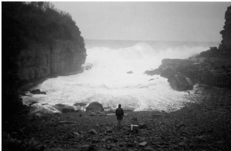
Tasman Peninsula field trip August 2003 Art, Natural Environment & Technology

In 2003 I moved to Hobart to complete the last semester of my degree at the University of Tasmania. One of the two units I enrolled in was Art, Natural Environment & Technology offered at the Tasmanian School of Art. This involved three fieldtrips of a number of days each: one to Queenstown, one to the Tasman Peninsula and one to Maria Island. I think the School of Visual and Performing Arts has similar undergraduate subjects that get art students out into the field, but as far as I know nothing remotely like this was ever available to me at my old university.