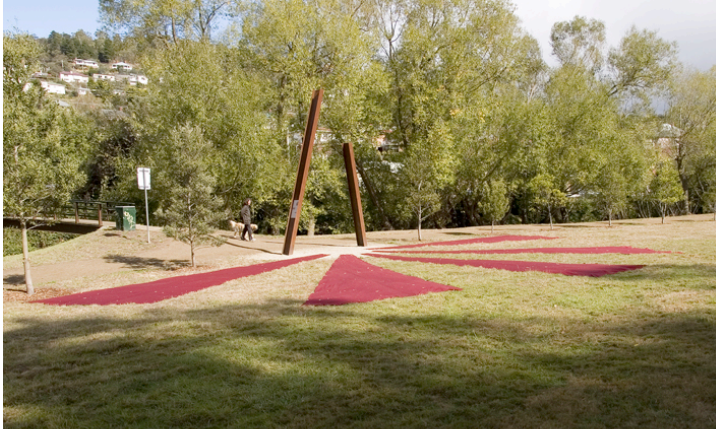
Site 10 x 20m Hessian, eyelets, tent pegs Mountain Festival Sculpture Trail, South Hobart Rivulet April-March 2006

of sight, onto the irregular surface of the ground. 2 The position of the work, unlike many other spots along the rivulet did not offer a view of Mount Wellington. My work invited passers-by to reorientate themselves by turning against the linear walking track, putting their back to the rivulet and lowering their line of sight to engage with their immediate surroundings. It enticed them to step out onto the work itself and spend a little time engaging with that particular space. In this way the work was an anti-lookout.