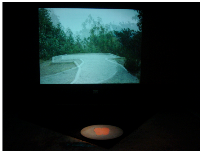
Lookout mixed media installation, dimensions variable Entrepot Gallery, December 2004

I produced a multimedia installation that employed the aesthetic components of a typical lookout amenity and facilitated various viewing experiences in which the audience inevitably became implicated in the scene. I wrote a 10,000 word research paper on visual perception, landscape conventions in art and in managed natural environments, ideas of the picturesque and the photogenic, tourism and environmental values.