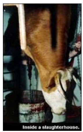
Fig. 2 Chennai Cows (left,) Slaughterhouse (right)