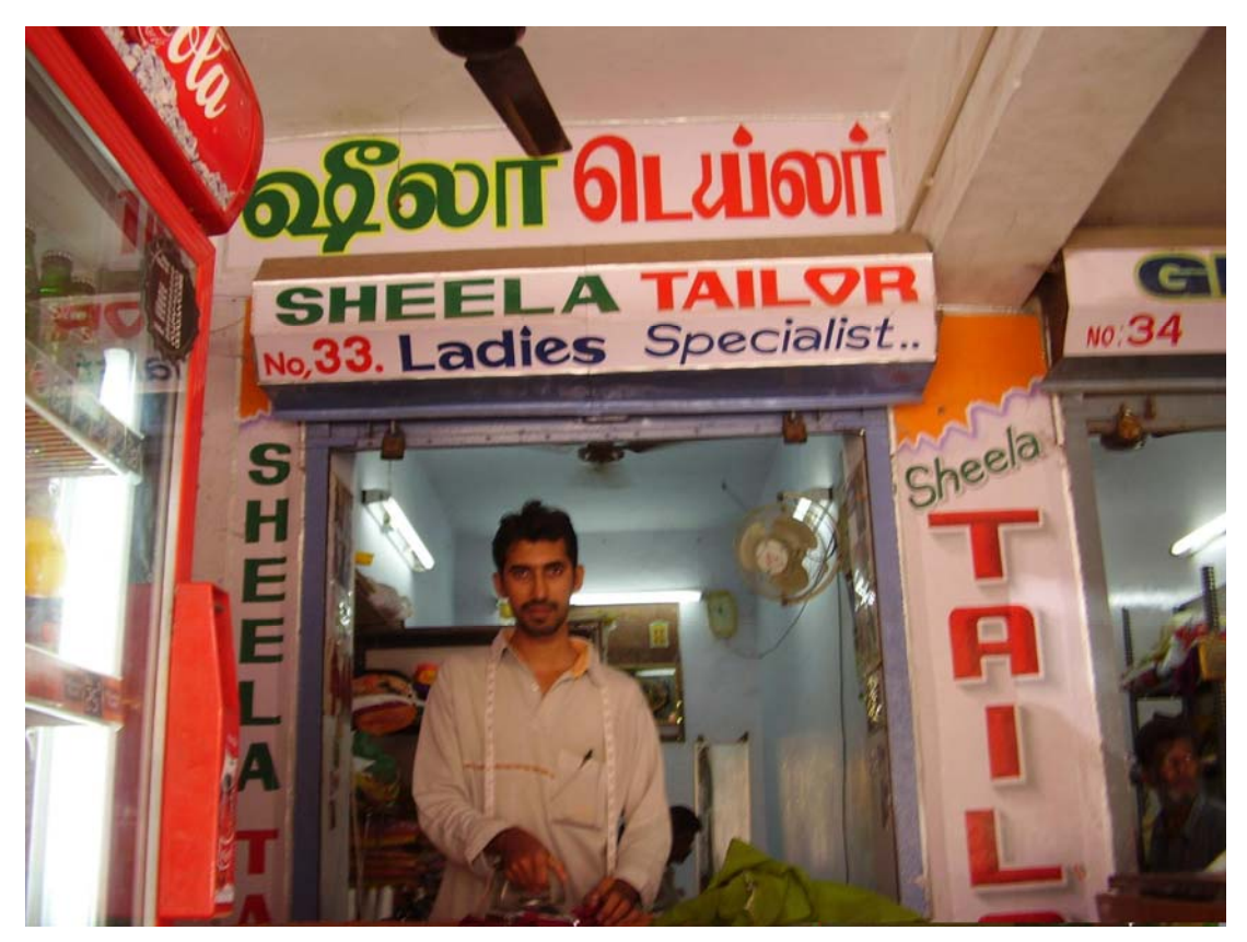
Fig. 4 Tailor, Nungambakkam