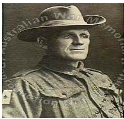
Fig. 3 Puggaree, Fort St George Museum (left); (right)

For the puggaree (a turban with a flap to cover the neck; fig. 3, left) apparently was appropriated and modified into the pleated hatband of the Australian slouch hat. The hat on the top right shows how the lower scarf, or pugari , can cover the back of the neck. This hat reputedly once belonged to Marcus Clarke.