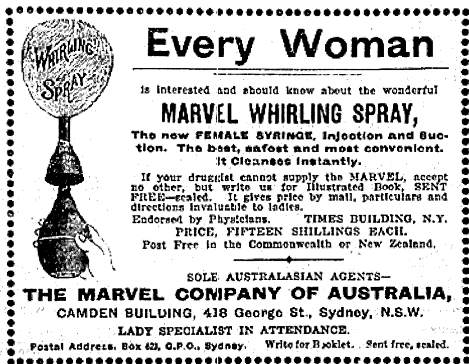
FIGURE 2. The Marvel Whirling Spray.