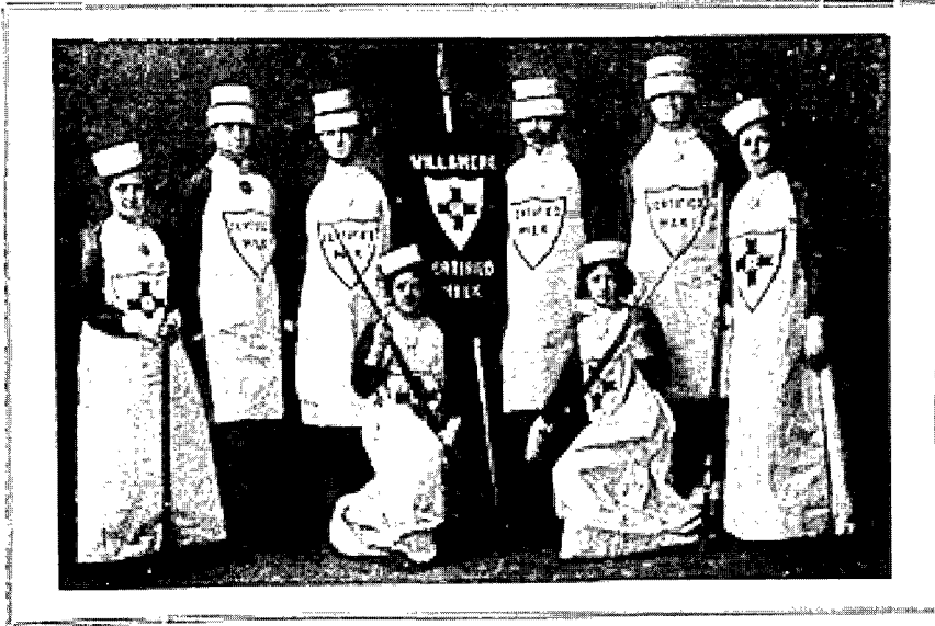
FIGURE 1. The Willsmere Certified Milk Company.